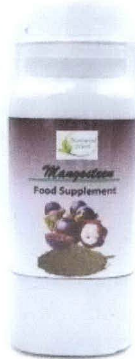
Figure 9. Unregistered NATURAL HERB Mangosteen Food Supplement