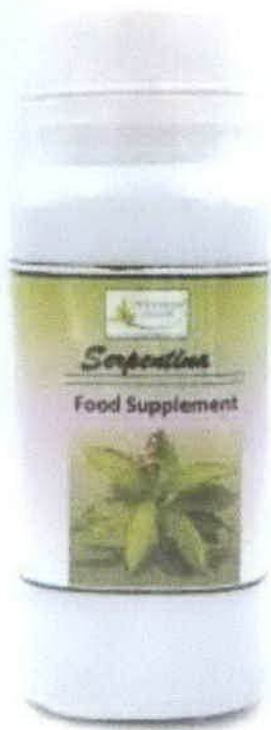
Figure 8. Unregistered NATURAL HERB Serpentina Food Supplement