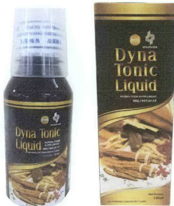
Figure 3. Unregistered DYNA TONIC LIQUID Herbal Food Supplement