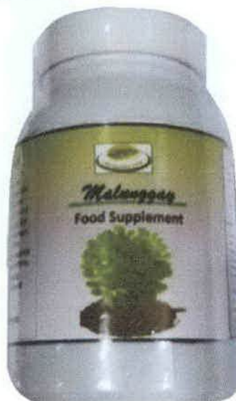
Figure 10. Unregistered NATURAL HERB Malunggay Food Supplement