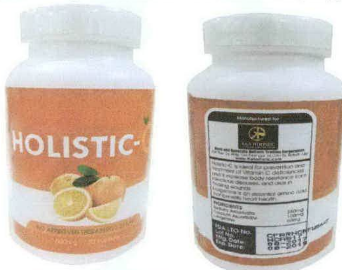
Figure 7. Unregistered HOLISTIC-C capsules