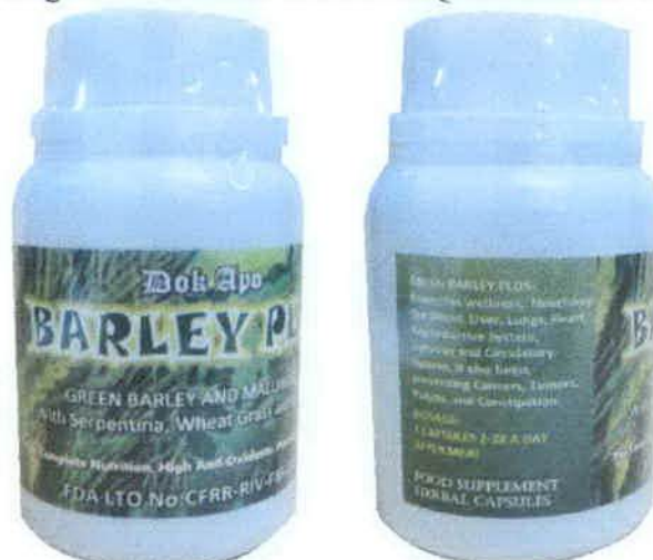
Figure 4. Unregistered DOK APO Barley Plus