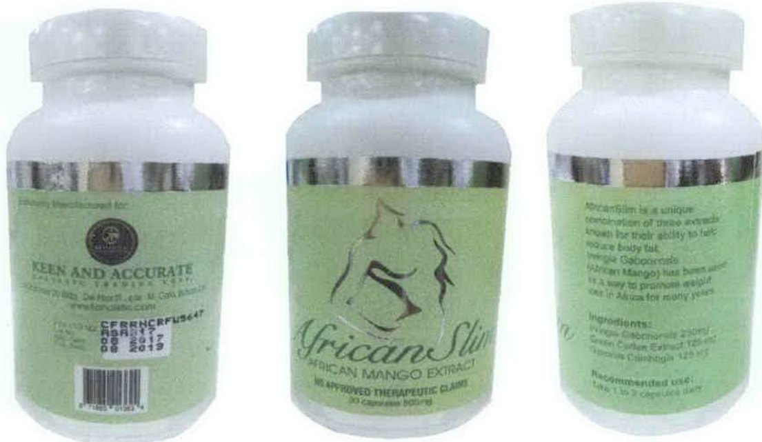
Figure 1. Unregistered African Slim African Mango Extract

The Food and Drug Administration (FDA) advises the public against the purchase and consumption of the following unregistered food supplements: