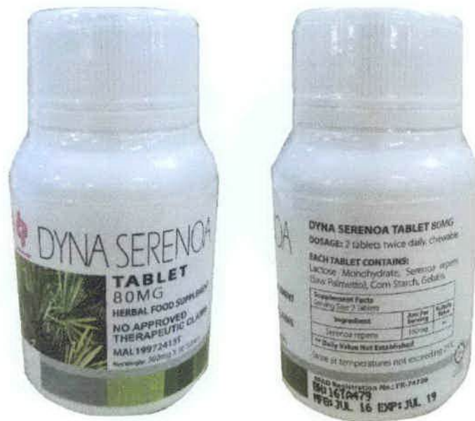
Figure 2. Unregistered DYNA SERENOA Tablet Herbal Food Supplement