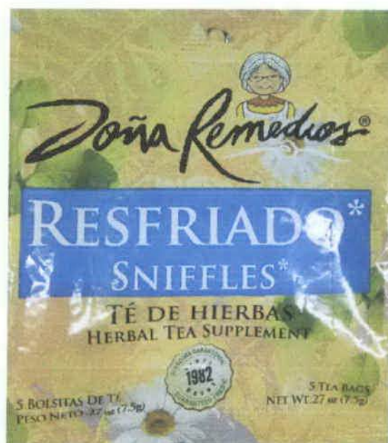
Figure 2. Unregistered DOÑA REMEDIOS RESFRIADO SINFFLES HERBAL TEA SUPPLEMENT