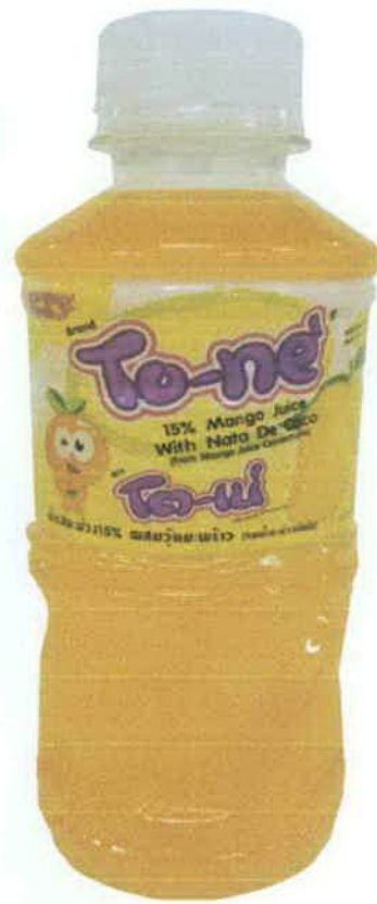
Figure 3. Unregistered TO-NE MANGO JUICE WITH NATA DE COCO