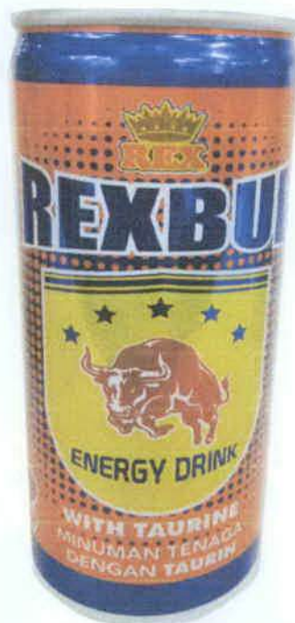
Figure 5. Unregistered REX REXBUL ENERGY DRINK WITH TAURINE