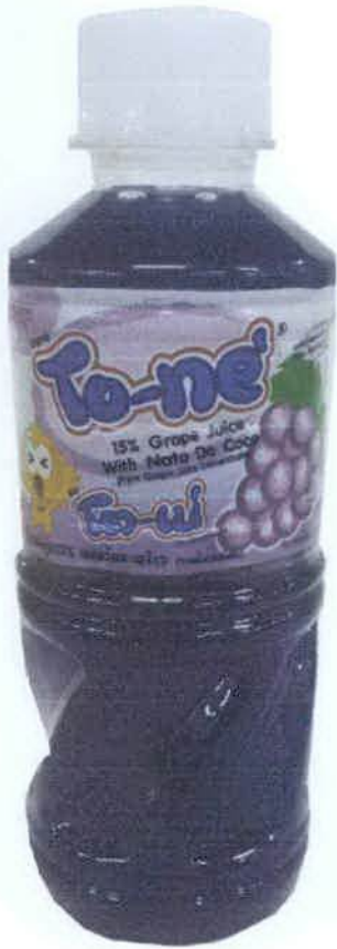
Figure 2. Unregistered TO-NE GRAPE JUICE WITH NATA DE COCO