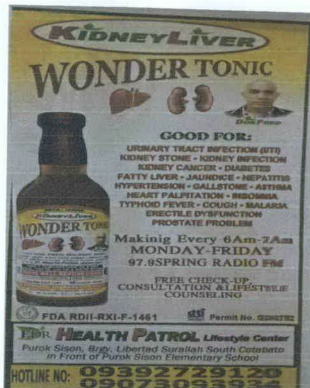
Figure 1. Sample Brochure of Unregistered Kidney Liver Wonder Tonic with Therapeutic Claims

The public is warned that the food product being advertised by HEALTH PATROL LIFESTYLE CENTER are not registered with the FDA. Pursuant to Republic Act No. 9711, otherwise known as the "Food and Drug Administration Act of 2009", the manufacture, importation, exportation, sale, offering for sale, distribution, transfer, non-consumer use, promotion, advertising or sponsorship of health products without the proper authorization from FDA is prohibited .