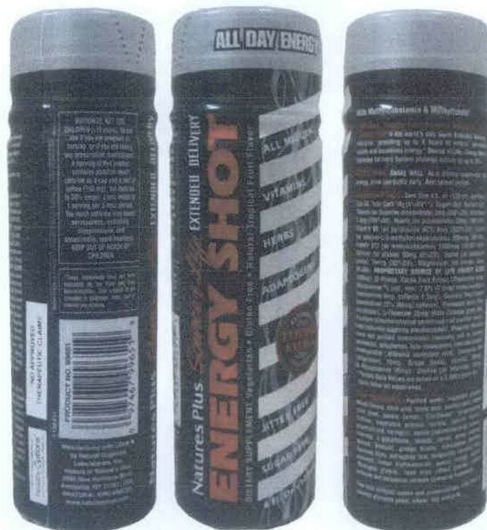
Figure 4. Unregistered Natures Plus Source of Life Energy Shot Dietary Supplement