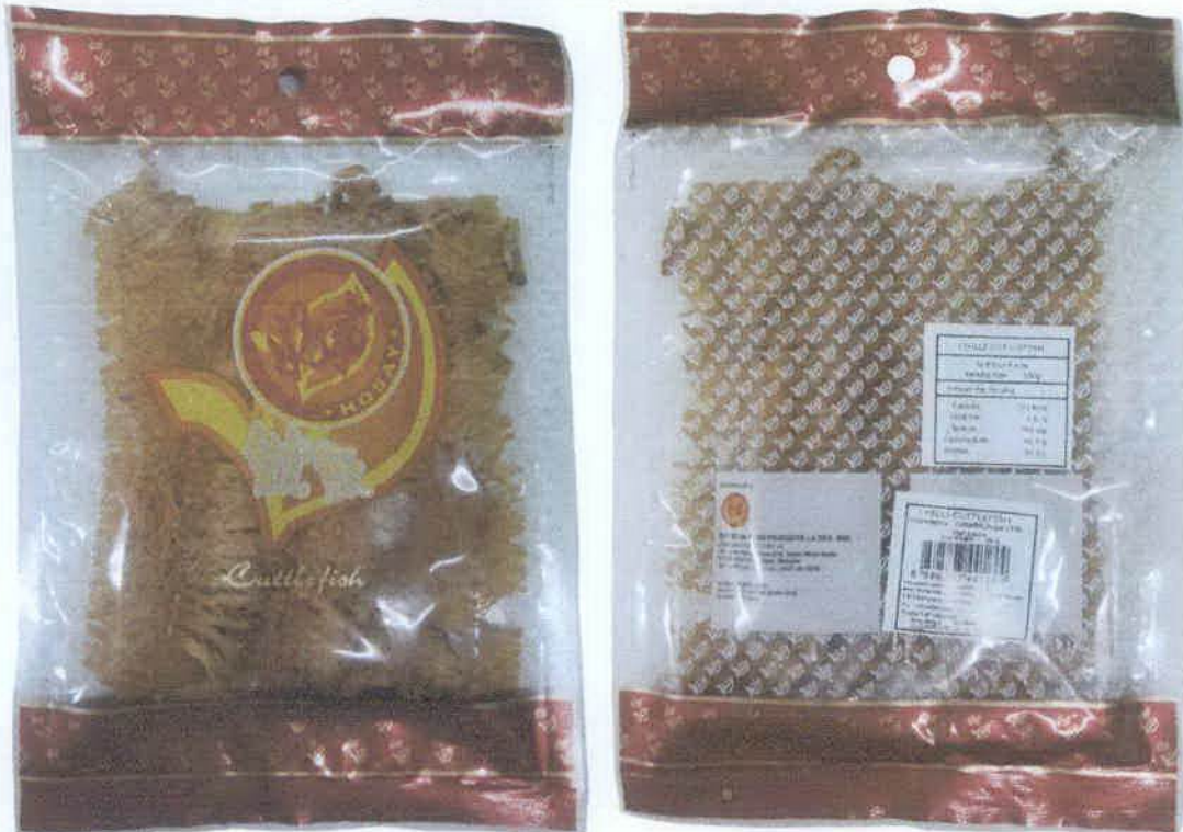
Figure 1. Unregistered Hosay Chilli Cuttlefish

The Food and Drug Administration (FDA) advises the public against the purchase and consumption of the following unregistered food products and food supplements: