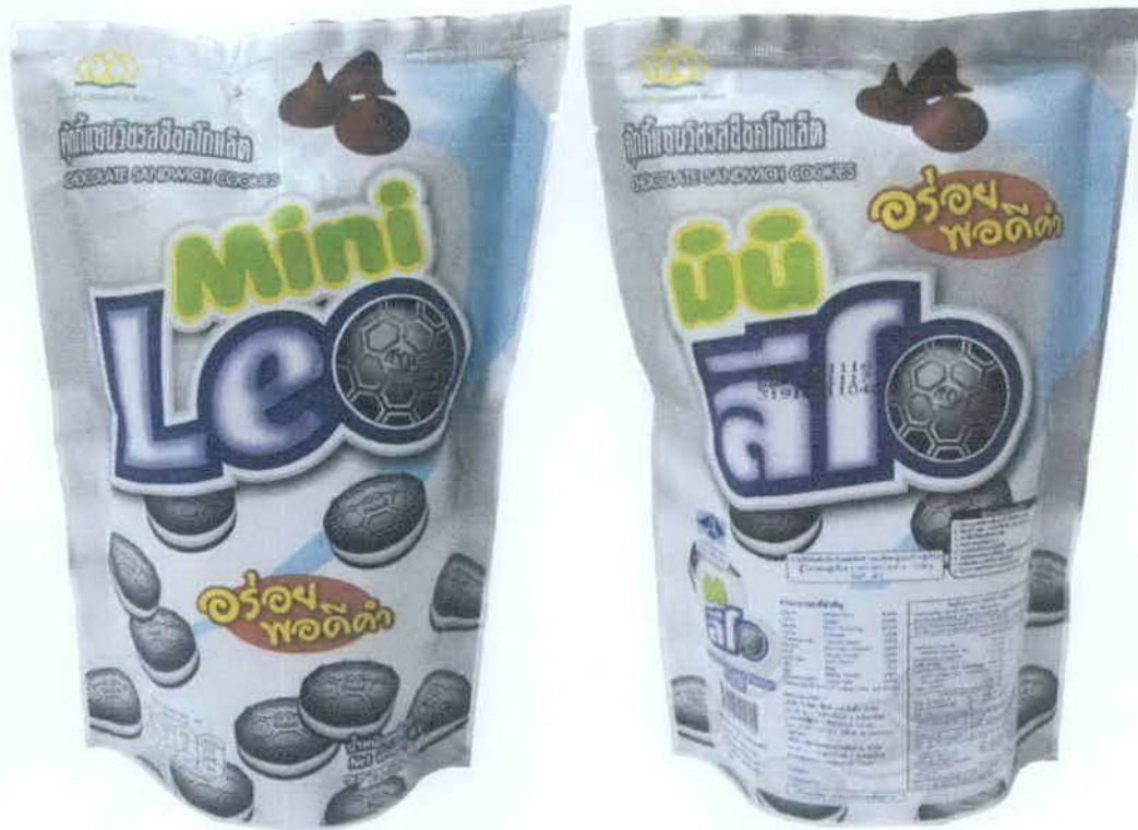
Figure 2. Unregistered Dorkbua Brand Mini Leo Chocolate Sandwich Cookies 70g