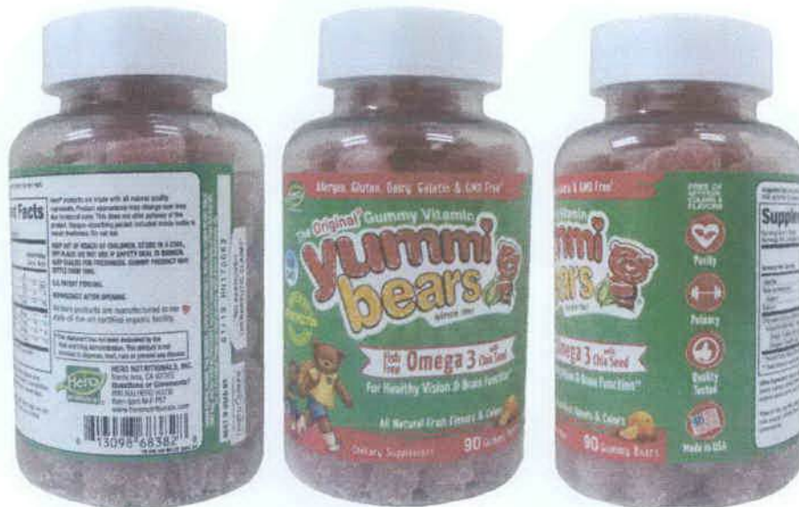
Figure 5. Unregistered Hero Nutritionals the Original Gummy Vitamin Yummi Bears

FDA post-marketing surveillance (PMS) activities have verified that the abovementioned food products and food supplements have not gone through the registration process of the agency and have not been issued the proper authorization in the form of Certificate of Product Registration. Pursuant to Republic Act No. 9711, otherwise known as the “Food and Drug Administration Act of 2009”, the manufacture, importation, exportation, sale, offering for sale, distribution, transfer, non-consumer use, promotion, advertising or sponsorship of health products without the proper authorization from FDA is prohibited.