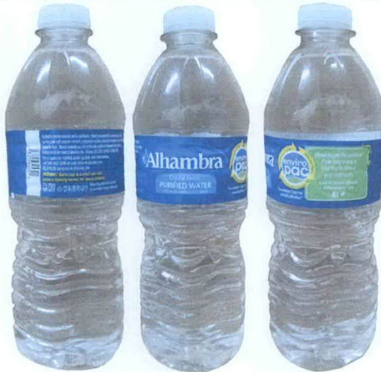
Figure 3. Unregistered Alhambra Crystal Fresh Purified Water