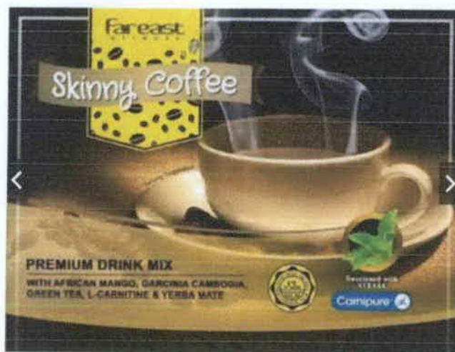
Figure 5. Unregistered FAREAST SKINNY COFFEE PREMIUM DRINK MIX