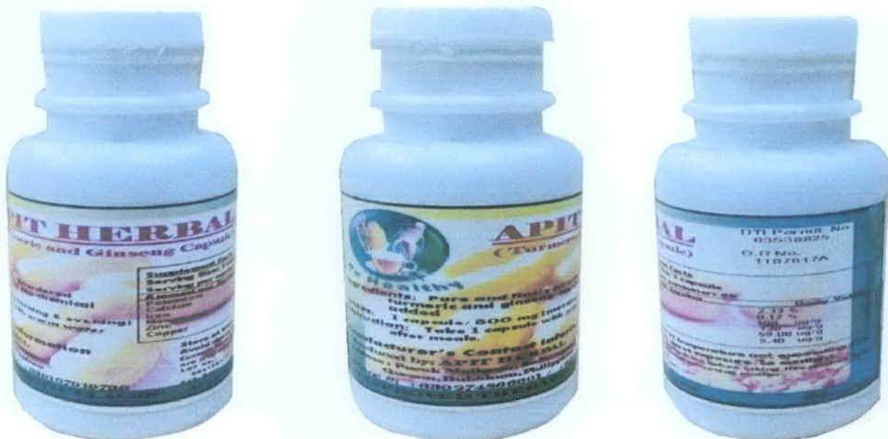
Figure 1. Unregistered APIT HERBAL (TURMERIC & GINSENG) CAPSULE

The Food and Drug Administration (FDA) advises the public against the purchase and consumption of the following unregistered food products: