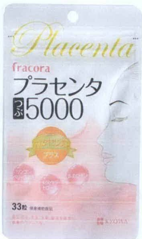
Figure 4. Unregistered FRACORA PLACENTA CAPSULE