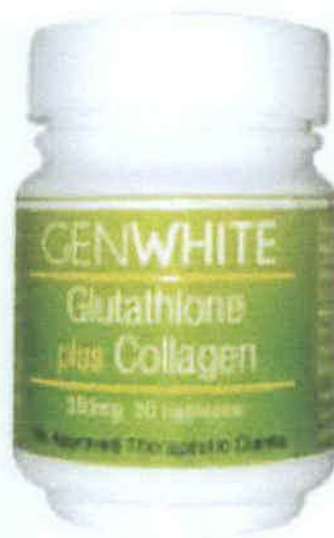
Figure 3. Unregistered GENWHITE GLUTATHIONE PLUS COLLAGEN CAPSULES