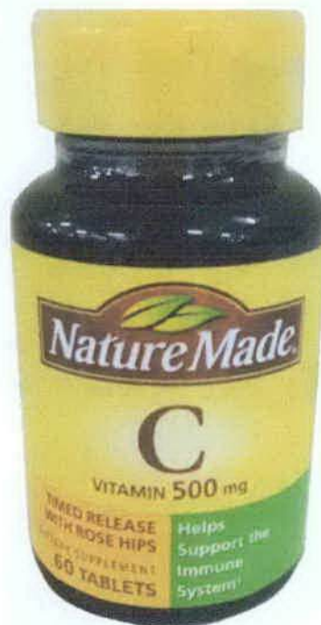
Figure 3. Unregistered NATURE MADE VITAMIN C 500mg Timed Release w/ Rose Hips