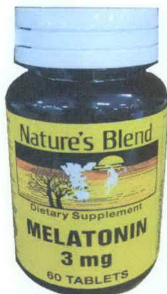
Figure 1. Unregistered NATURE'S BLEND MELATONIN 3mg DIETARY SUPPLEMENT

The Food and Drug Administration (FDA) advises the public against the purchase and consumption of the following unregistered food supplements: