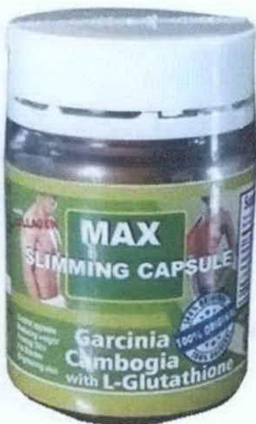
Figure 4. Unregistered MAX SLIMMING CAPSULE GARCINIA CAMBOGIA WITH L-GLUTATHIONE