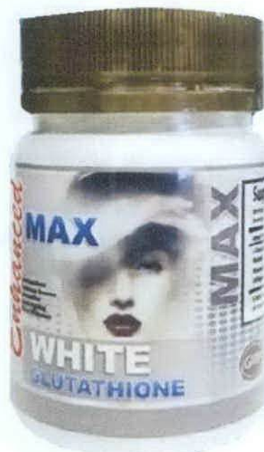
Figure 5. Unregistered MAX WHITE GLUTATHIONE