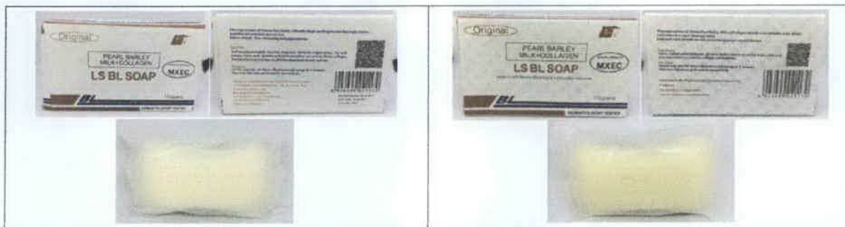
Figure 1. Packaging and Soap Color of the Authentic LS BL Soap Pearl Barley Milk + Collagen 115G