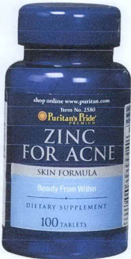
Figure 2. Unregistered PURITAN'S PRIDE Zinc for Acne Skin Formula Dietary Supplement