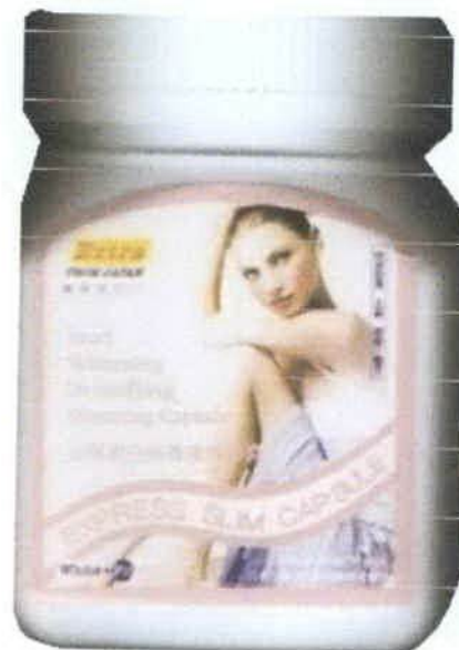
Figure 1. Unregistered Pearl Whitening Detoxifying Slimming Capsule EXPRESS SLIM CAPSULE