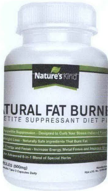
Figure 3. Unregistered NATURE'S KIND Natural Fat Burner, Appetite Suppressant Diet Pills