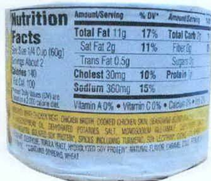
Figure 3. Unregistered UNDERWOOD Chicken Spread