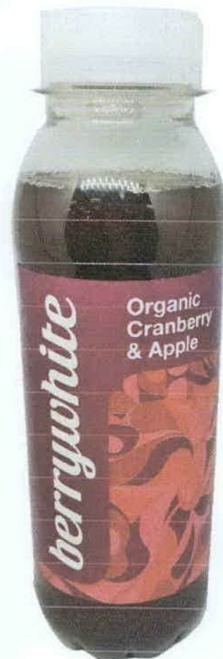
Figure 4. Unregistered BERRYWHITE Organic, Cranberry & Apple