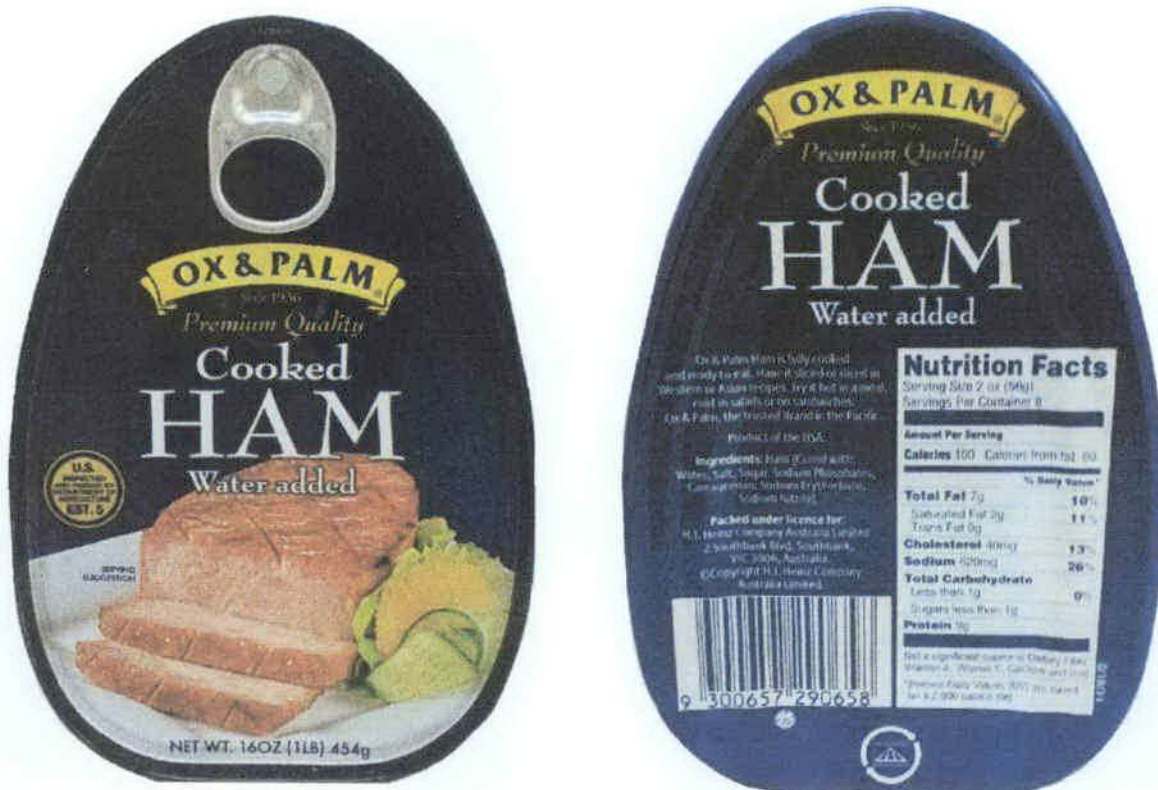
Figure 1. Unregistered OX & PALM Cooked Ham, Water added

The Food and Drug Administration (FDA) advises the public against the purchase and consumption of the following unregistered food products: