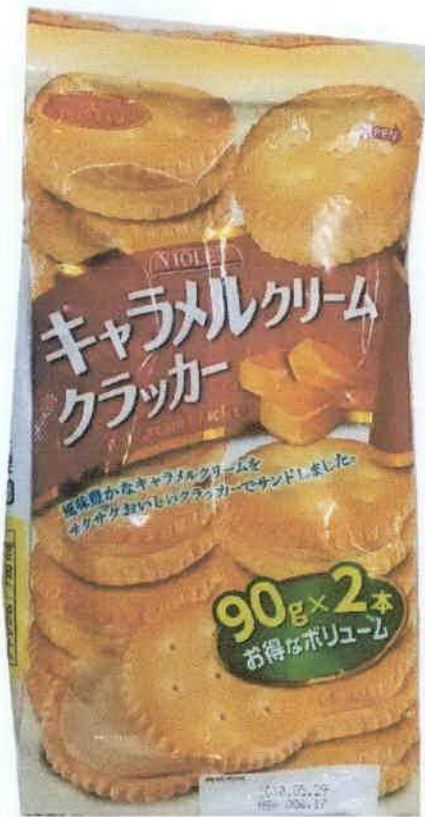
Figure 4. Unregistered IMPERIAL VIOLET Caramel Cream Cracker