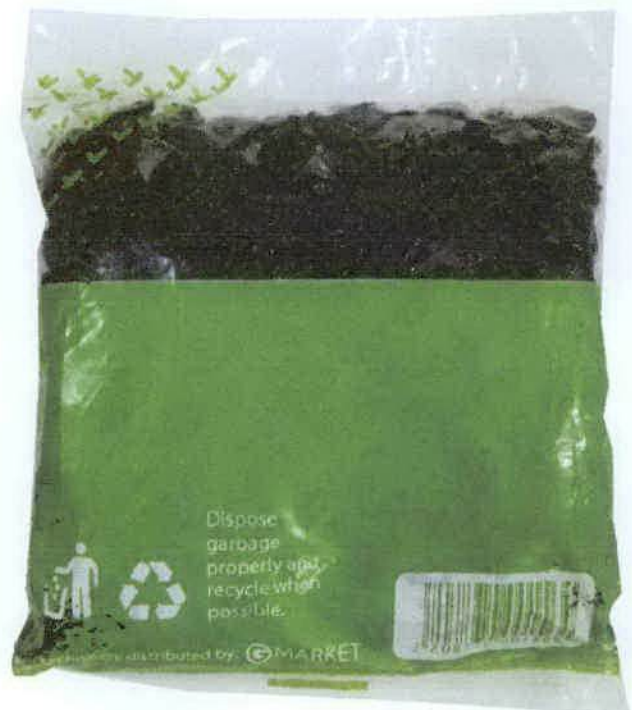
Figure 3. Unregistered GREAT VALUE California Raisin