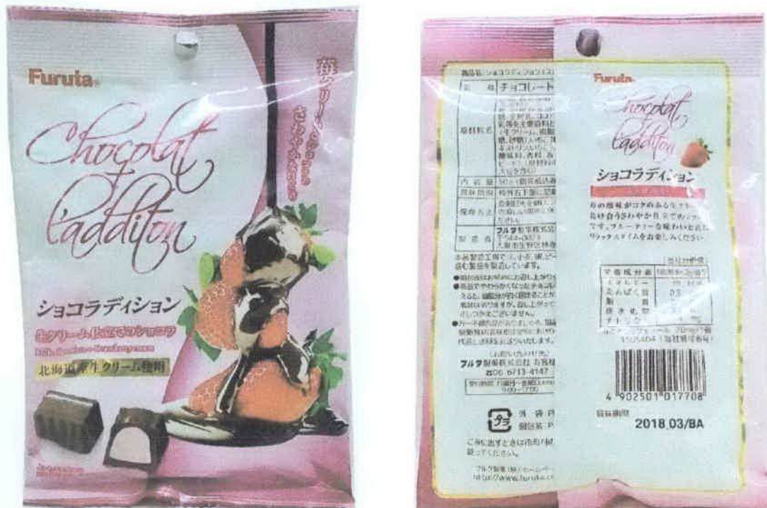
Figure 1. Unregistered FURUTA Chocolat L'additon Milk Chocolate + Strawberry Cream

The Food and Drug Administration (FDA) advises the public against the purchase and consumption of the following unregistered food products: