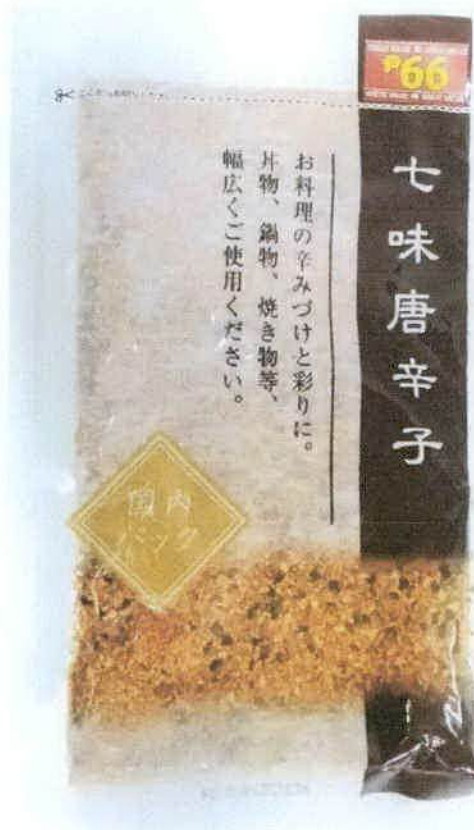
Figure 5. Unregistered JAPAN HOME Chili Flakes