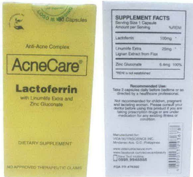
Figure 3. Unregistered AcneCare Lactoferrin with Linumlife Extra and Zinc Gluconate Dietary Supplement