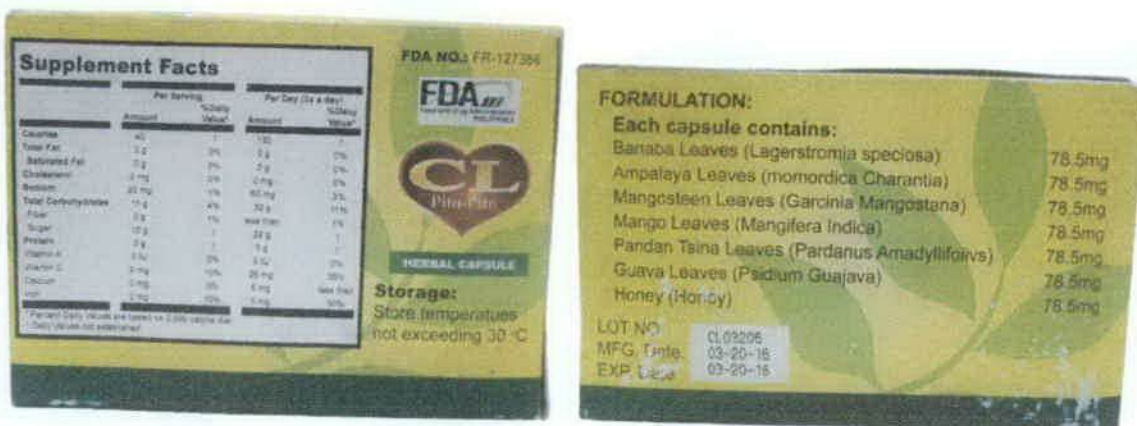
Figure 5. Unregistered CL Pito-Pito Herbal Capsule