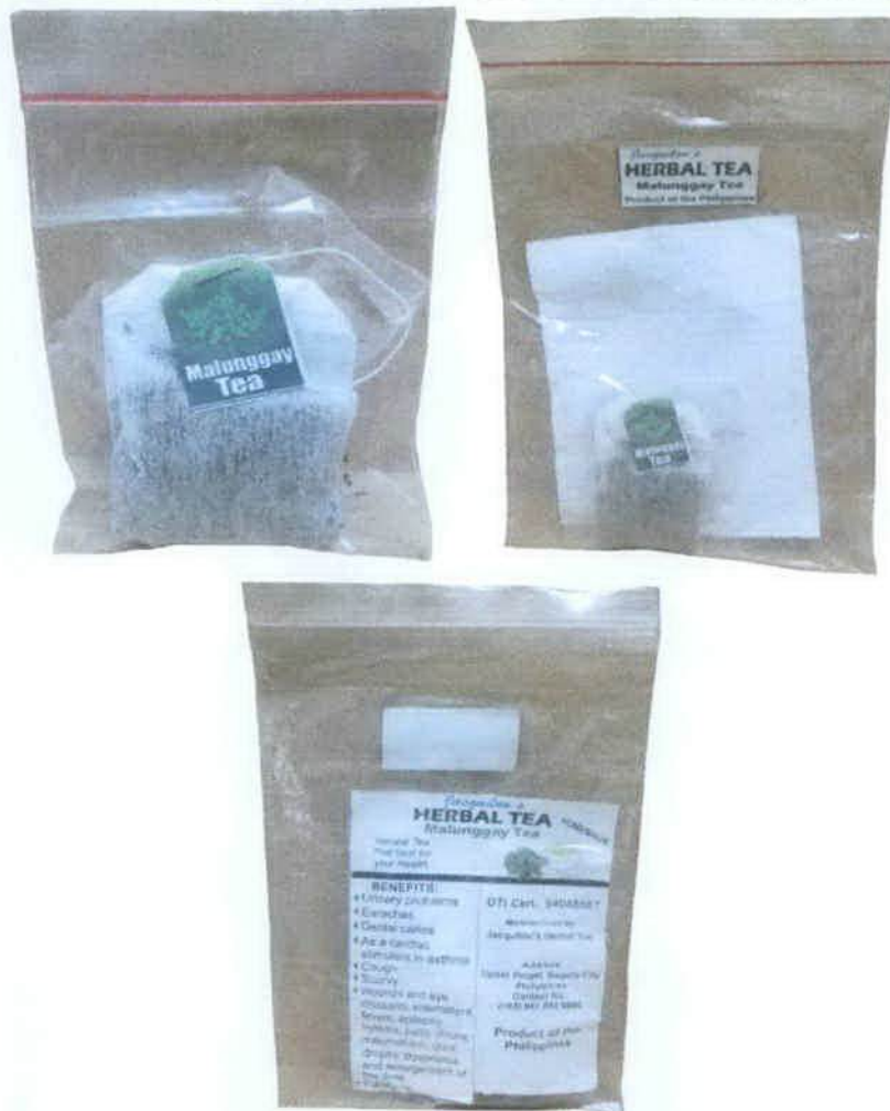
Figure 1. Unregistered Jacquilou's Herbal Tea Malunggay Tea

The Food and Drug Administration (FDA) advises the public against the purchase and consumption of the following unregistered food products and food supplements: