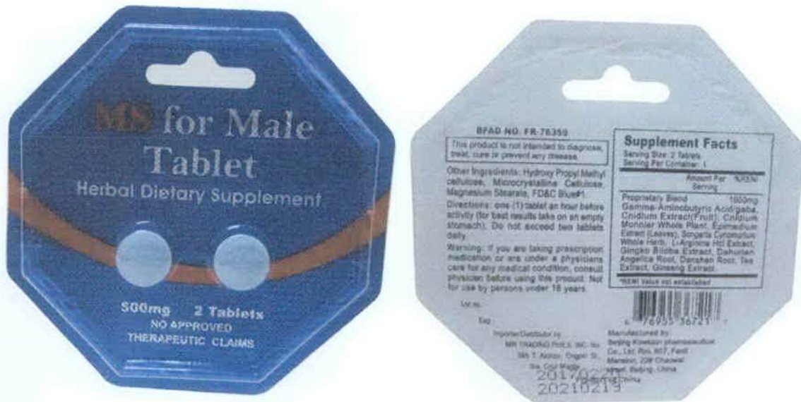
Figure 4. Unregistered MS for Male Tablet