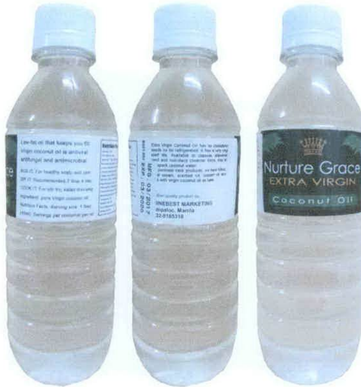
Figure 2. Unregistered Nurture Grace Extra Virgin Coconut Oil