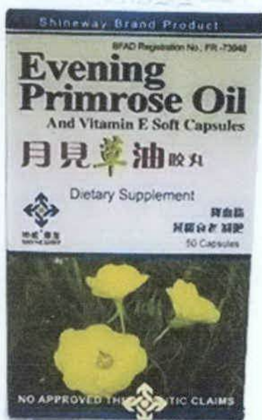
Figure 3. Unregistered Shineway Brand Evening Primrose Oil and Vitamin E