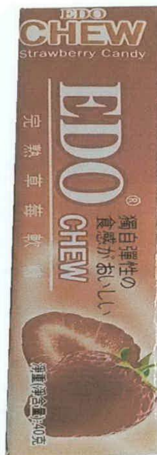
Figure 4. Unregistered EDO CHEW Strawberry Candy