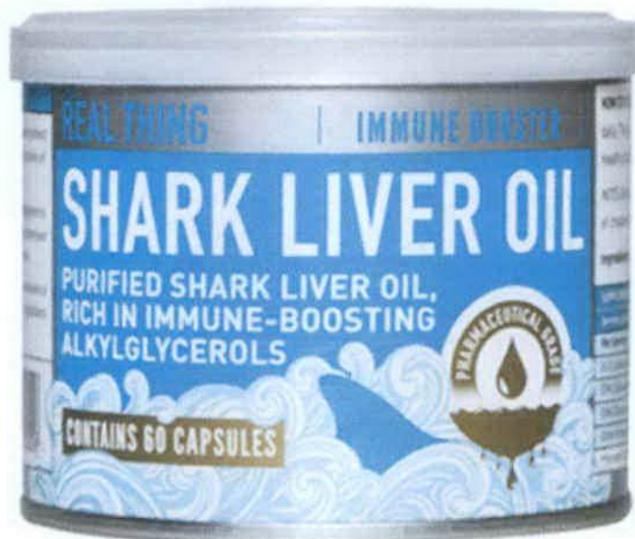
Figure 3. Unregistered SHARK LIVER OIL