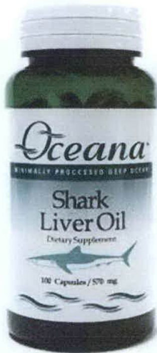
Figure 2. Unregistered OCEANA SHARK LIVER OIL Dietary Supplement