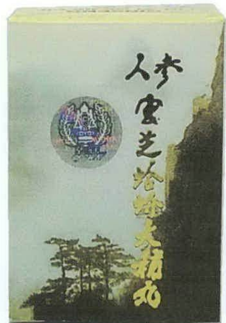
Figure 1. Unregistered GINSENG LIN-ZI GEJIE PIL