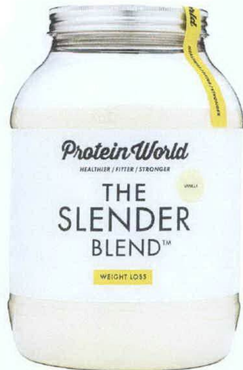
Figure 4. Unregistered PROTEIN WORLD The Slender Blend, Vanilla Flavor