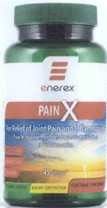
Figure 3. Unregistered ENEREX PAIN X