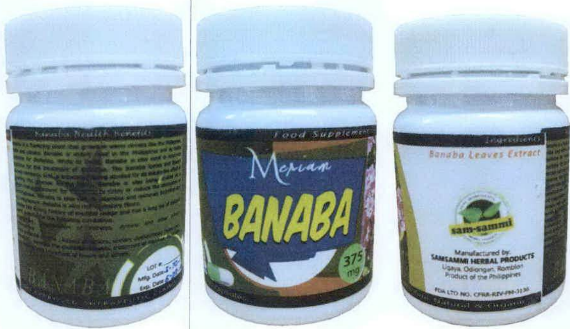
Figure 4. Unregistered Meriam Banaba Food Supplement