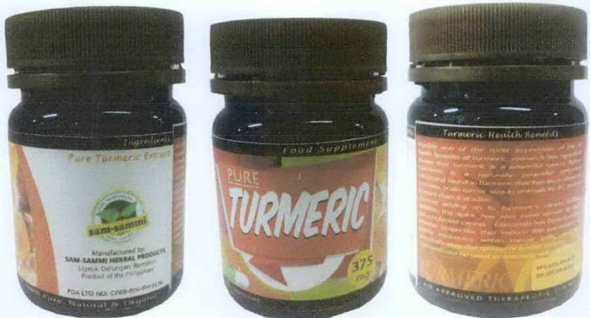
Figure 3. Unregistered Pure Turmeric Food Supplement