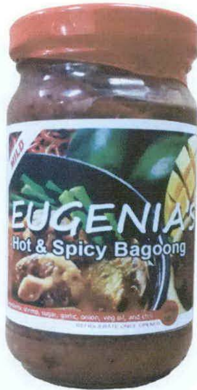
Figure 2. Unregistered Eugenia's Hot & Spicy Bagoong