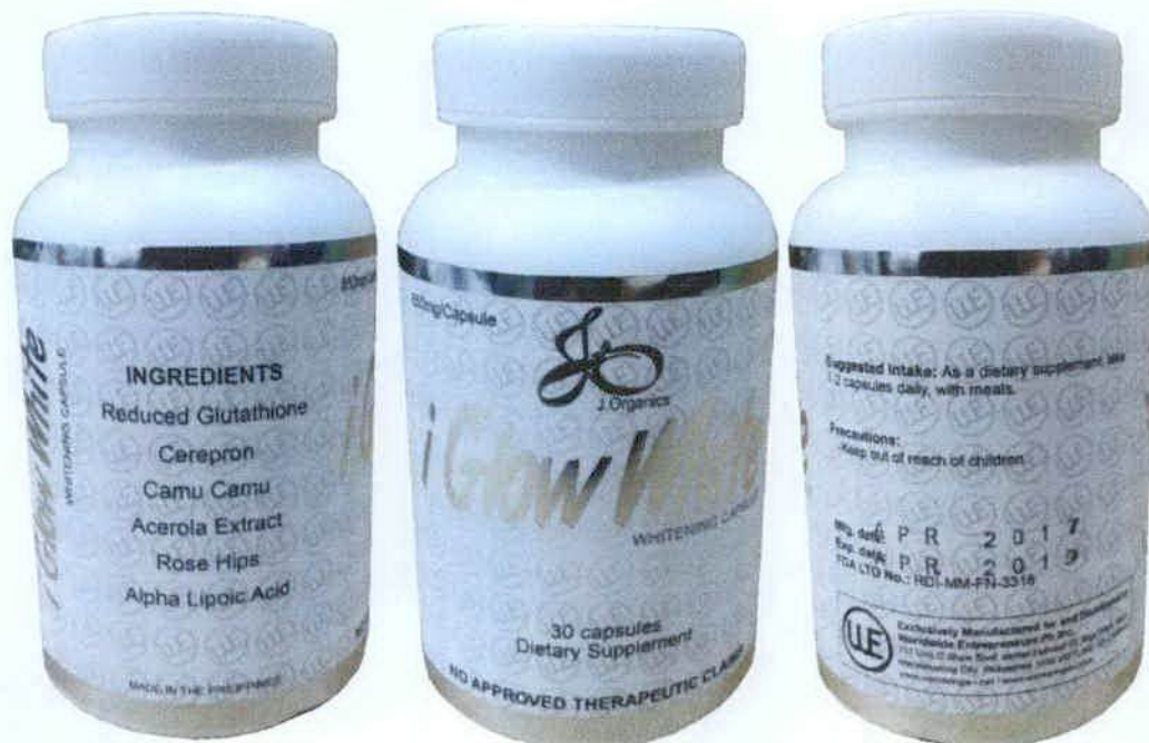
Figure 1. Unregistered J. Organics i Glow White Whitening Capsule

The Food and Drug Administration (FDA) advises the public against the purchase and consumption of the following unregistered food product and food supplements: