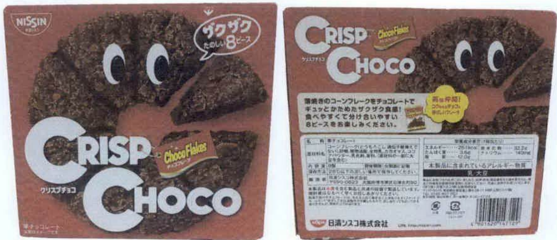
Figure 4. Unregistered Nissin Crisp Choco Choco Flakes