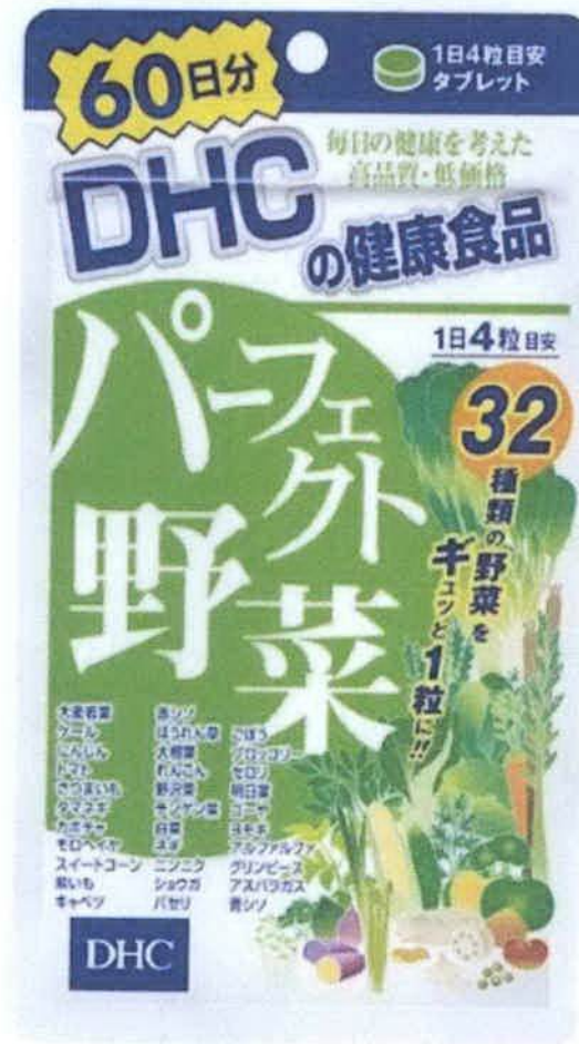
Figure 5. Unregistered DHC PERFECT Vegetable Supplement