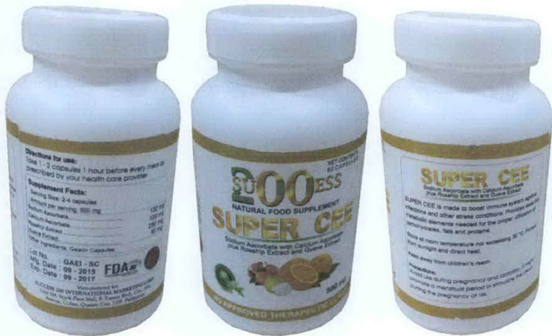
Figure 3. Unregistered Super Cee Natural Food Supplement