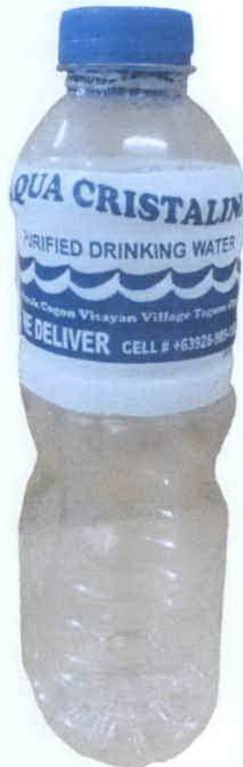
Figure 1. Unregistered Aqua Cristalina Purified Drinking Water

The Food and Drug Administration (FDA) advises the public against the purchase and consumption of the following unregistered food products and food supplements: