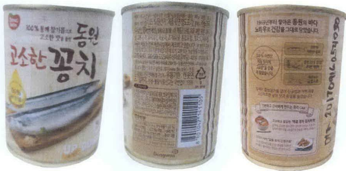
Figure 5. Unregistered DONG WON Canned Fish (Foreign Markings)