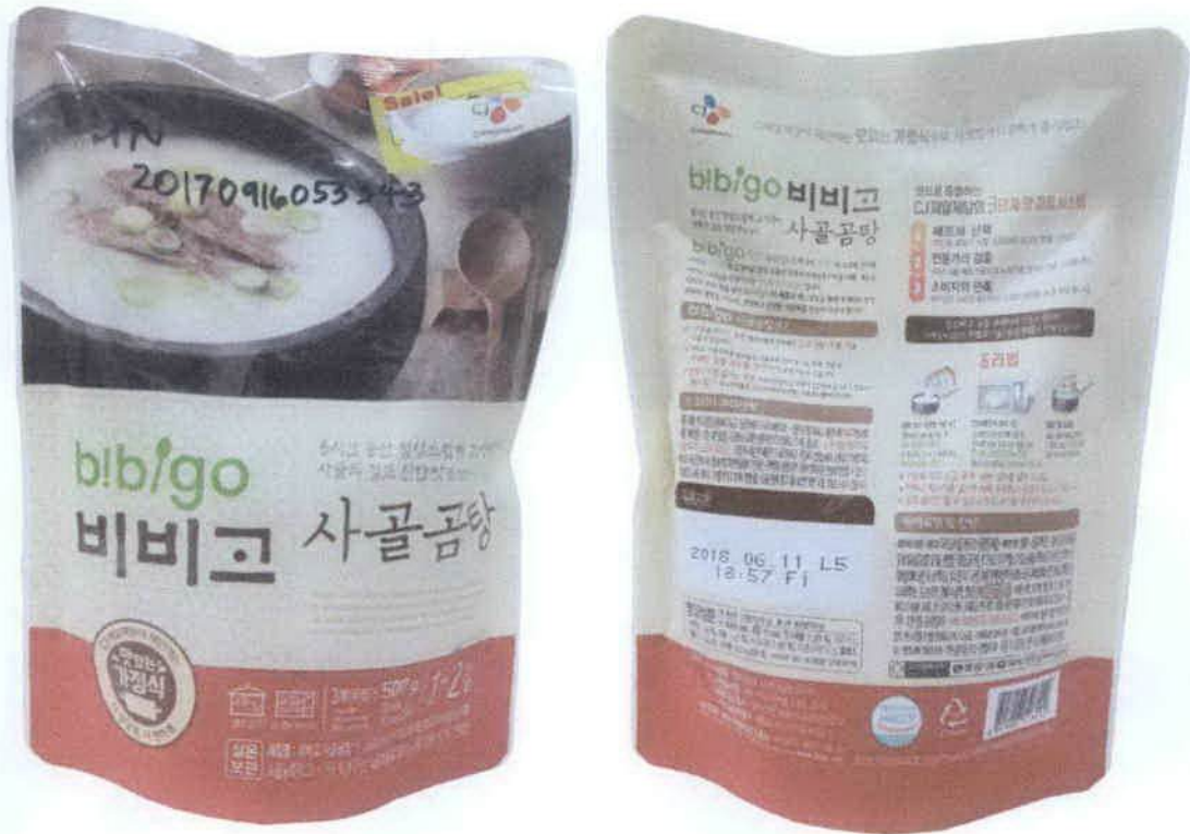
Figure 4. Unregistered BIBIGO Beef Soup (Foreign Markings)