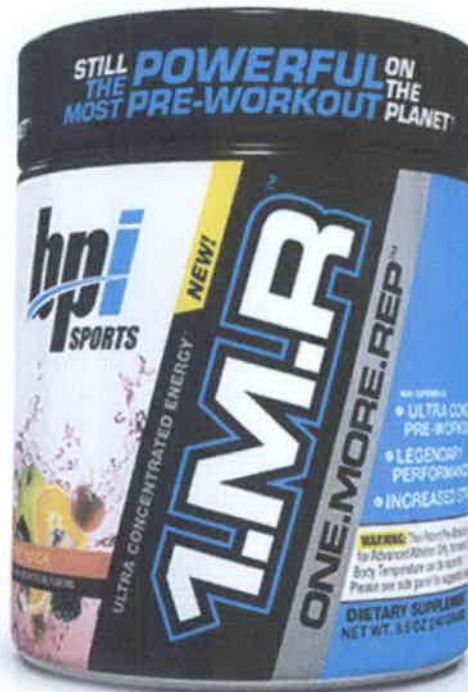
Figure 1. Unregistered BPI SPORTS 1.M.R Ultra-concentrated Pre-Workout Energy Powdered Drink

The Food and Drug Administration (FDA) advises the public against the purchase and consumption of the following unregistered food products: