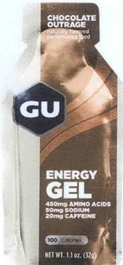
Figure 3. Unregistered GU Energy Gel, Chocolate Outrage