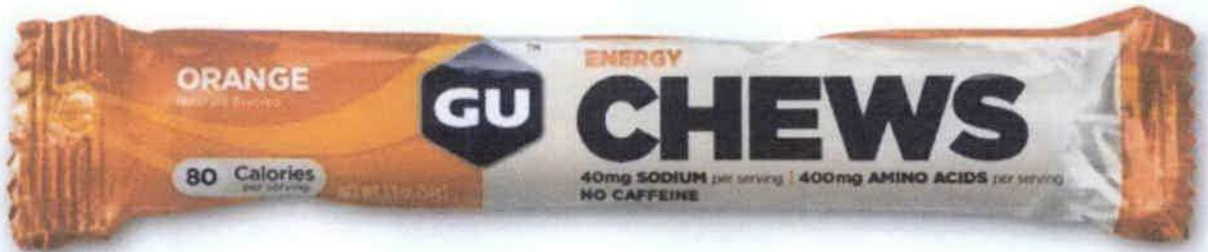
Figure 2. Unregistered GU Energy Gel Chews, Orange