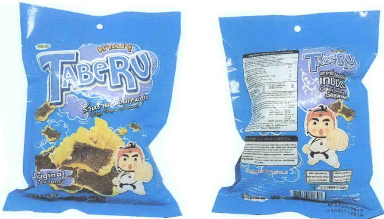
Figure 1. Unregistered TABERU Crispy Tempura Seaweed, Original Flavor

The Food and Drug Administration (FDA) advises the public against the purchase and consumption of the following unregistered food products: