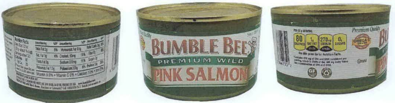
Figure 2. Unregistered BUMBLE BEE Premium Wild Pink Salmon