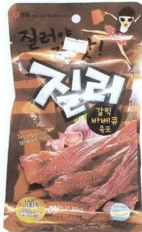
Figure 4. Unregistered ZILLER GARLIC BBQ Beef Jerky