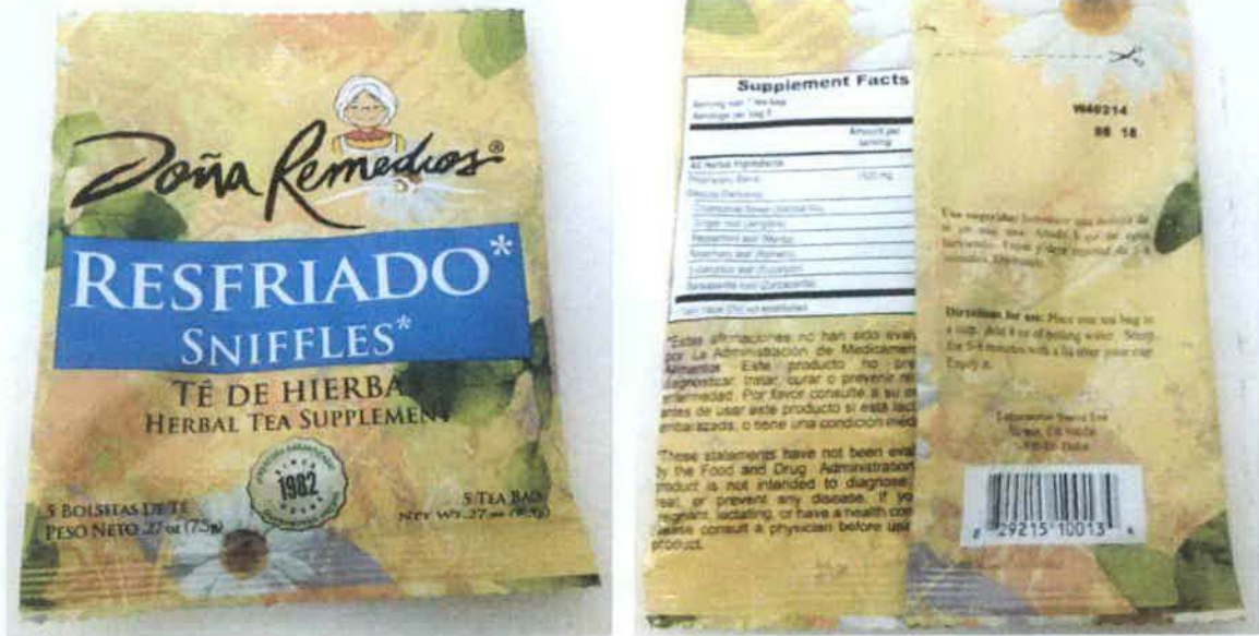
Figure 2. Unregistered Doña Remedios Sniffles Herbal Tea Supplement