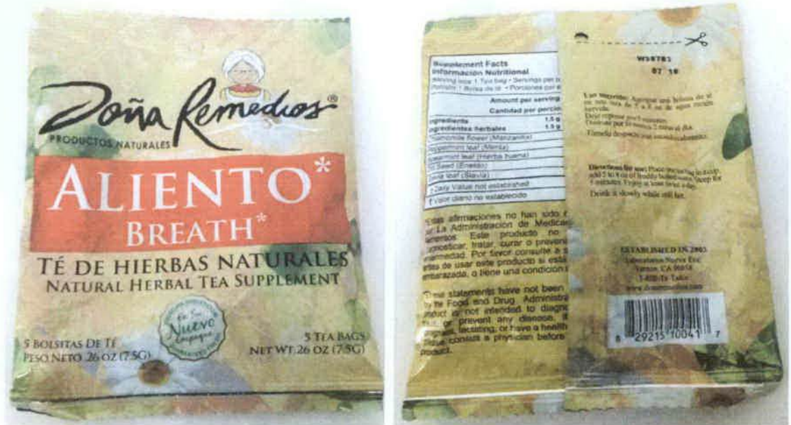
Figure 3. Unregistered Doña Remedios Breath Natural Herbal Tea Supplement