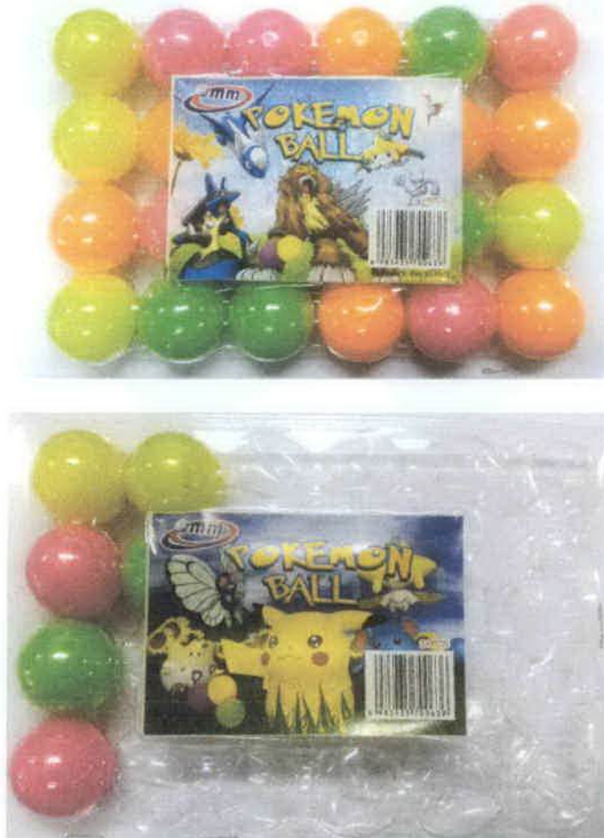
Figure 1. Unregistered MM POKEMON BALL Candy

The Food and Drug Administration (FDA) advises the public against the purchase and consumption of the following unregistered food products and food supplements: