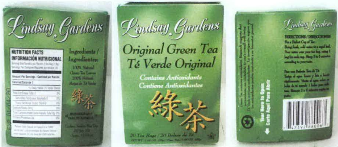
Figure 4. Unregistered Lindsay Gardens Original Green Tea