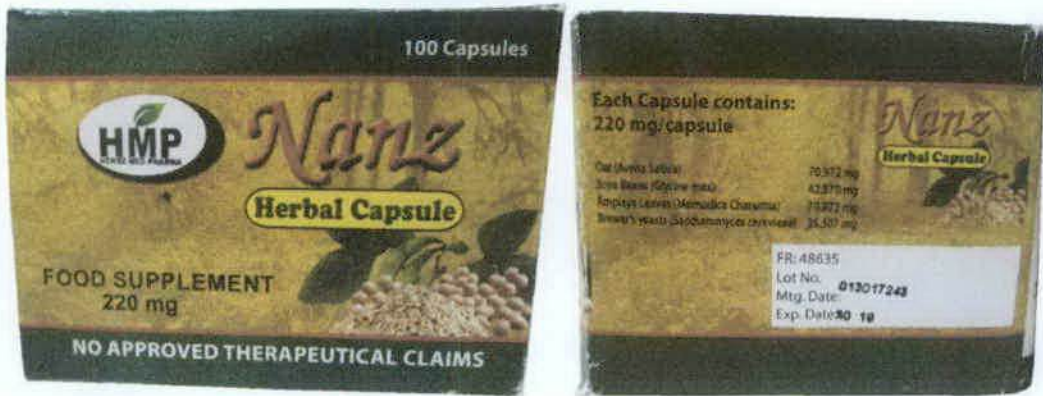
Figure 4. Unregistered Nanz Herbal Capsule Food Supplement