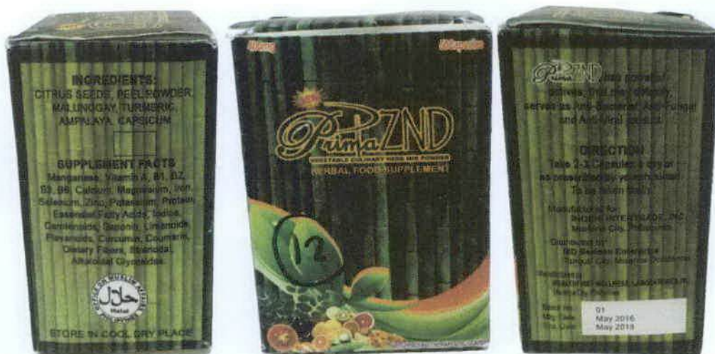
Figure 6. Unregistered PrimaZND Vegetable Culinary Herb Mix Powder 400mg

FDA post-marketing surveillance (PMS) activities have verified that the abovementioned food supplements have not gone through the registration process of the agency and have not been issued the proper authorization in the form of Certificate of Product Registration. Pursuant to Republic Act No. 9711, otherwise known as the “Food and Drug Administration Act of 2009”, the manufacture, importation, exportation, sale, offering for sale, distribution, transfer, non-consumer use, promotion, advertising or sponsorship of health products without the proper authorization from FDA is prohibited.