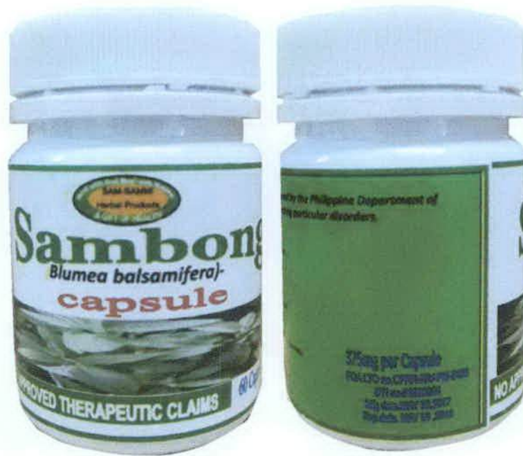
Figure 2. Unregistered Sambong Blumea balsamifera Capsule