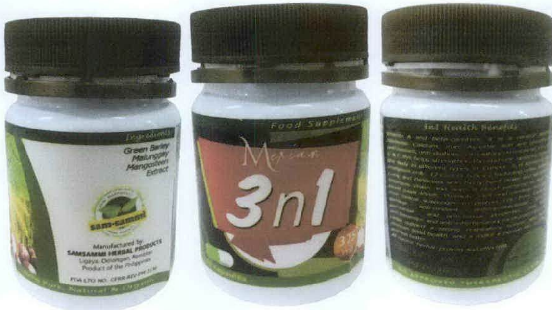
Figure 1. Unregistered Meriam 3 n 1 Food Supplement

The Food and Drug Administration (FDA) advises the public against the purchase and consumption of the following unregistered food supplements: