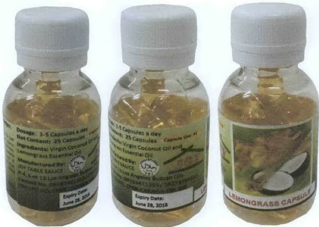
Figure 5. Unregistered Lemon Grass Capsule