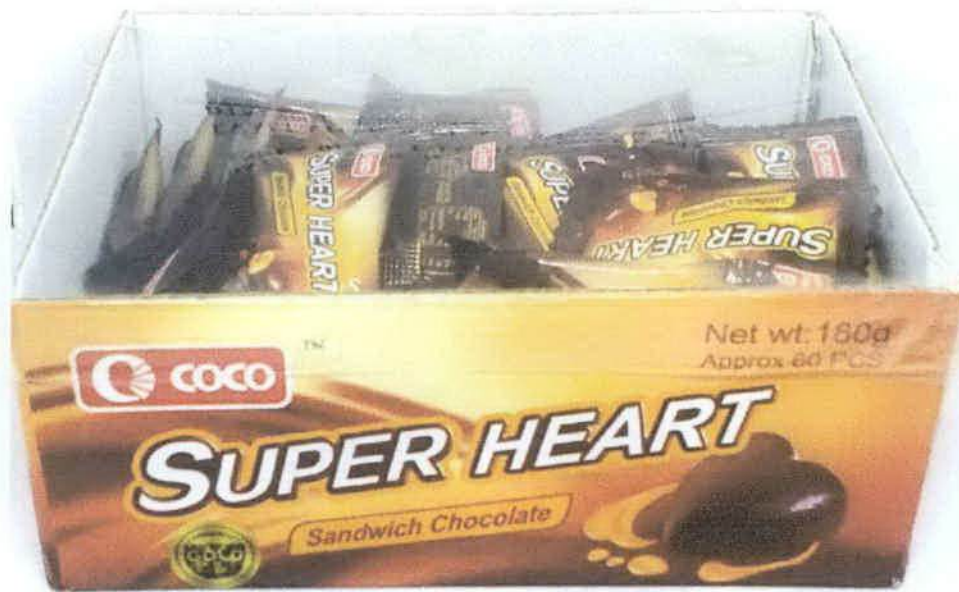
Figure 4. Unregistered COCO SUPER HEART Sandwich Chocolate