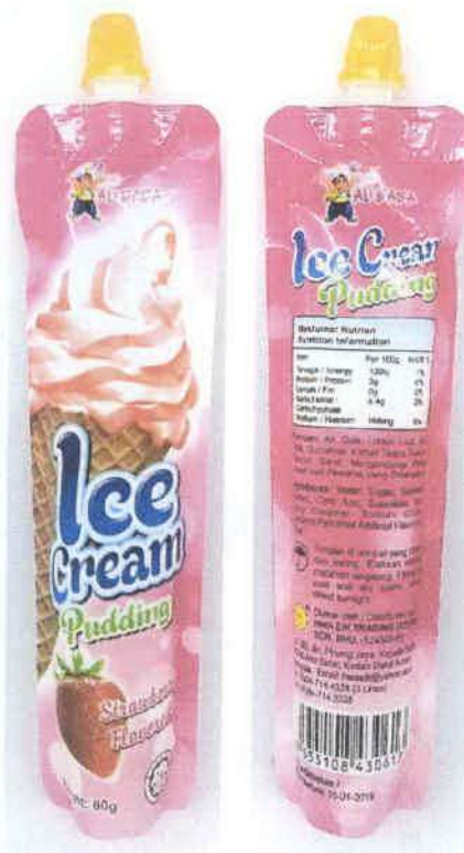
Figure 3. Unregistered ALIBABA Ice Cream Pudding Strawberry Flavor