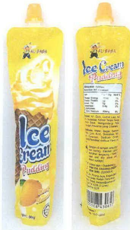
Figure 2. Unregistered ALIBABA Ice Cream Pudding Mango Flavor