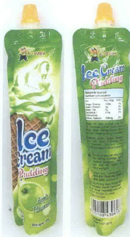
Figure 1. Unregistered ALIBABA Ice Cream Pudding Apple Flavor

The Food and Drug Administration (FDA) advises the public against the purchase and consumption of the following unregistered food products: