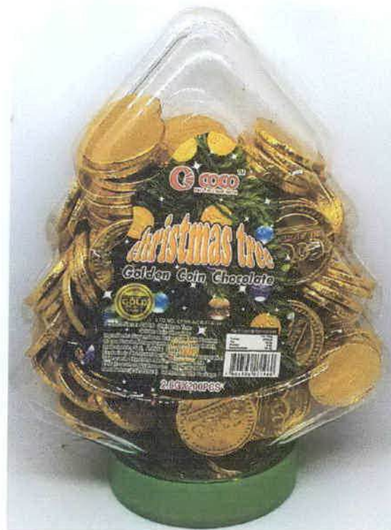
Figure 5. Unregistered COCO FALL IN LOVE WITH Christmas Tree Golden Coin Chocolate

FDA post-marketing surveillance (PMS) activities have verified that the abovementioned food products have not gone through the registration process of the agency and have not been issued the proper authorization in the form of Certificate of Product Registration. Pursuant to Republic Act No. 9711, otherwise known as the "Food and Drug Administration Act of 2009", the manufacture, importation, exportation, sale, offering for sale, distribution, transfer, non-consumer