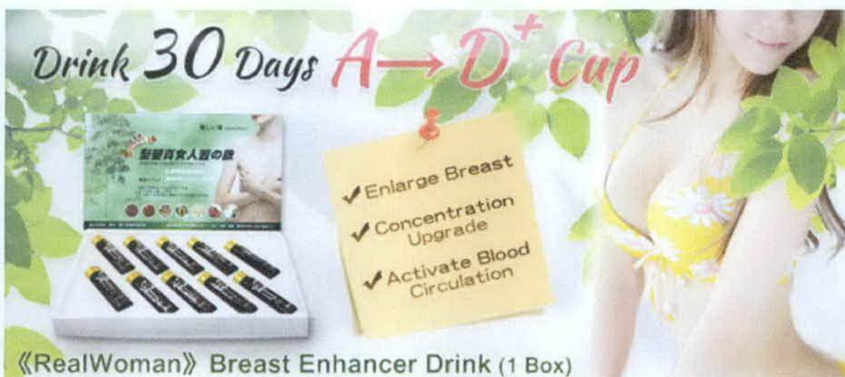
Figure 5. Unregistered Real Woman Breast Enhancer Drink

FDA post-marketing surveillance (PMS) activities have verified that the abovementioned food products and food supplements have not gone through the registration process of the agency and have not been issued the proper authorization in the form of Certificate of Product Registration. Pursuant to Republic Act No. 9711, otherwise known as the “Food and Drug Administration Act of 2009”, the manufacture, importation, exportation, sale, offering for sale, distribution, transfer, non-consumer use, promotion, advertising or sponsorship of health products without the proper authorization from FDA is prohibited.