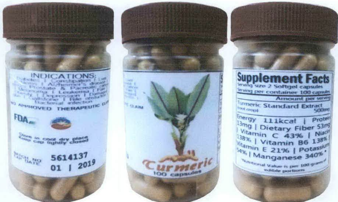
Figure 1. Unregistered Turmeric Capsules

The Food and Drug Administration (FDA) advises the public against the purchase and consumption of the following unregistered food products and food supplements: