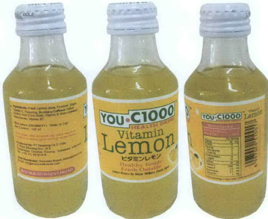
Figure 3. Unregistered YOU C1000 Health Drink Vitamin Lemon