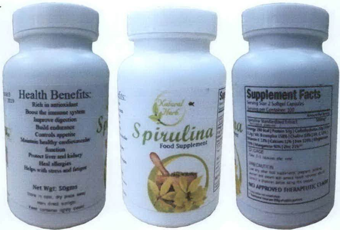
Figure 2. Unregistered Natural Herb Spirulina Food Supplement