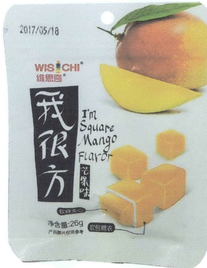
Figure 1. Unregistered WISCHI I'm Square Mango Flavor Candy

The Food and Drug Administration (FDA) advises the public against the purchase and consumption of the following unregistered food products: