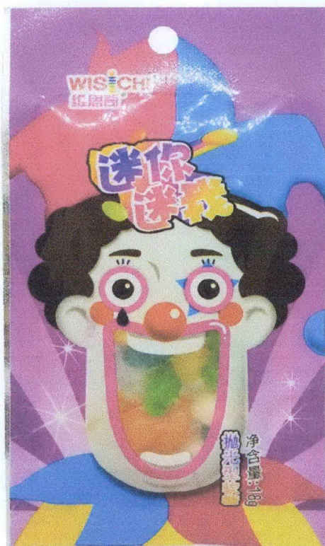
Figure 2. Unregistered WISCHI Assorted Candies (in yellow and pink packaging)