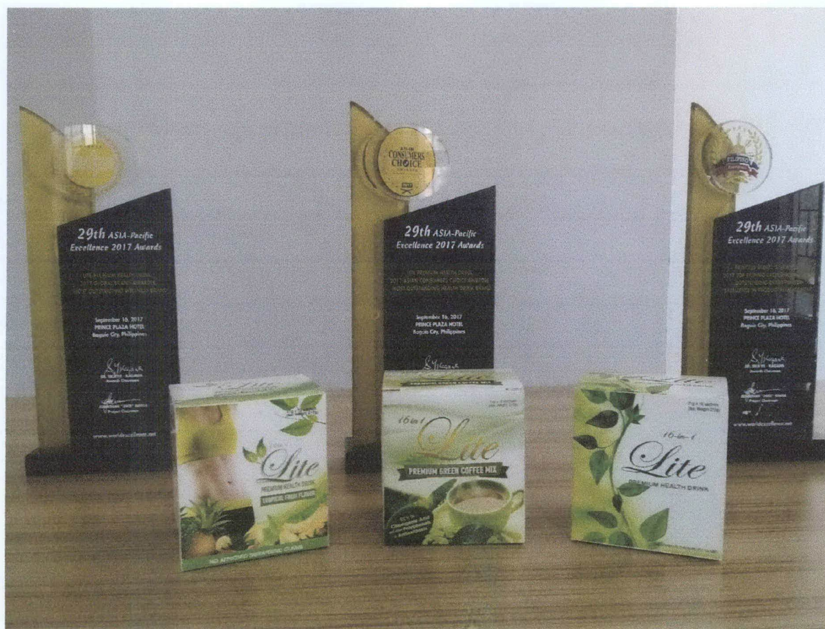
Figure 1. Unregistered LITE Food Products Monitored Online

The Food and Drug Administration (FDA) warns the public against unregistered LITE food products with therapeutic claims sold online: