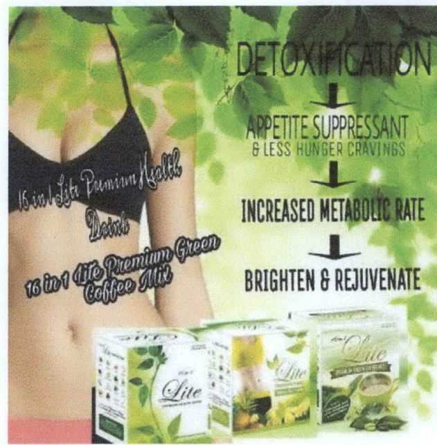
Figure 2. Unregistered 16in1 Lite Food Products with Unapproved claims