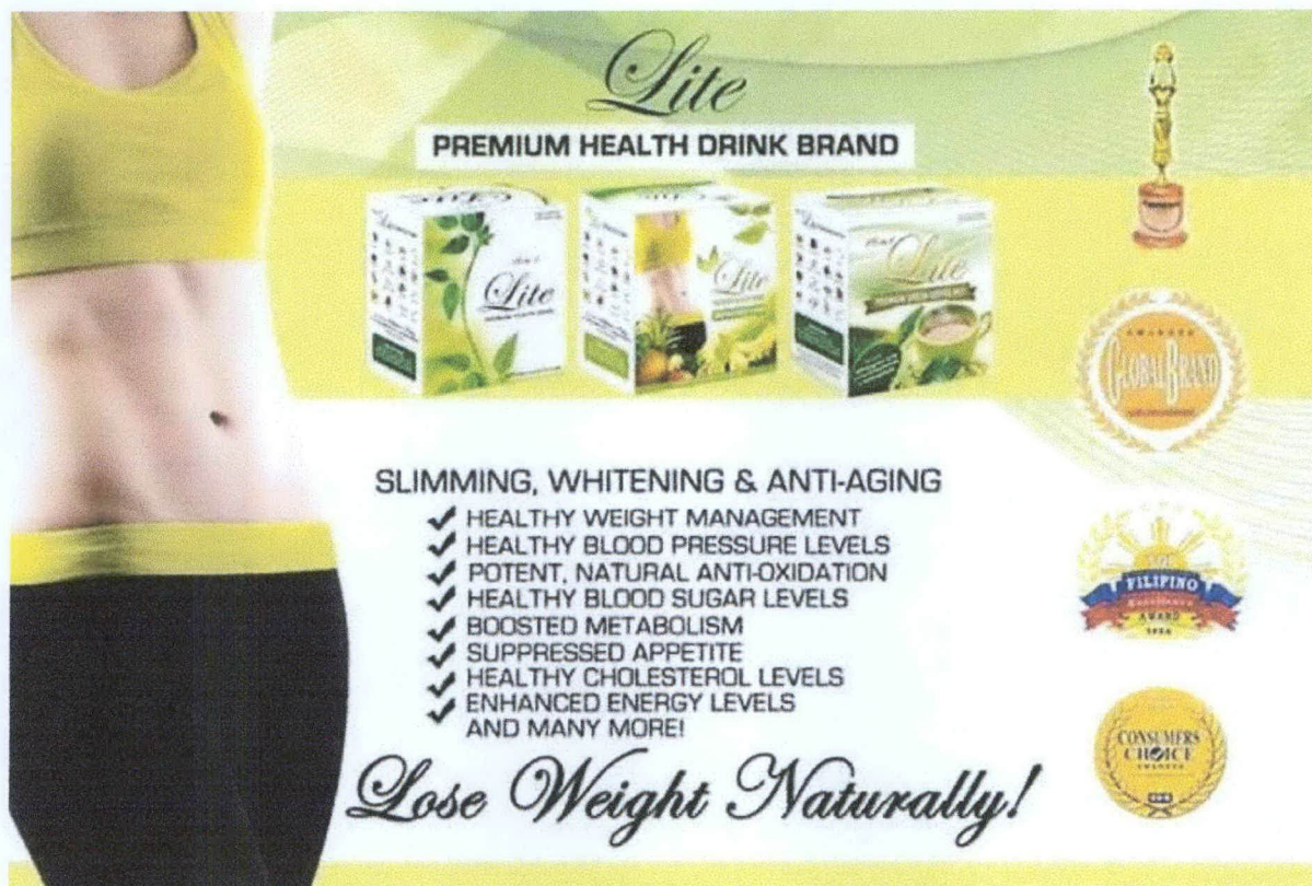
Figure 3. Unregistered 16in1 Lite Premium Health Drink Brand with Unapproved claims