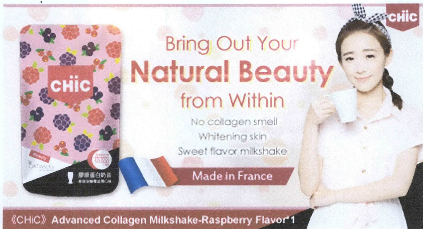
Figure 4. Unregistered Chic Advanced Collagen Milkshake Raspberry Flavor