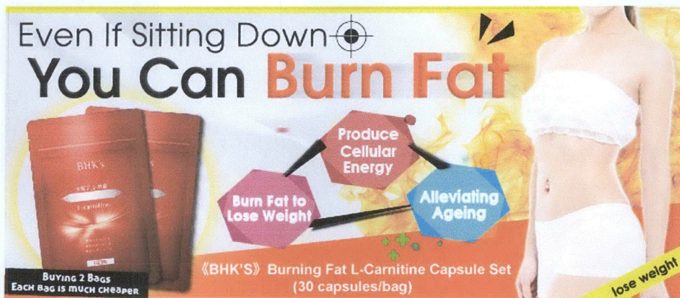
Figure 2. Unregistered BHK's Burning Fat L- Carnitine