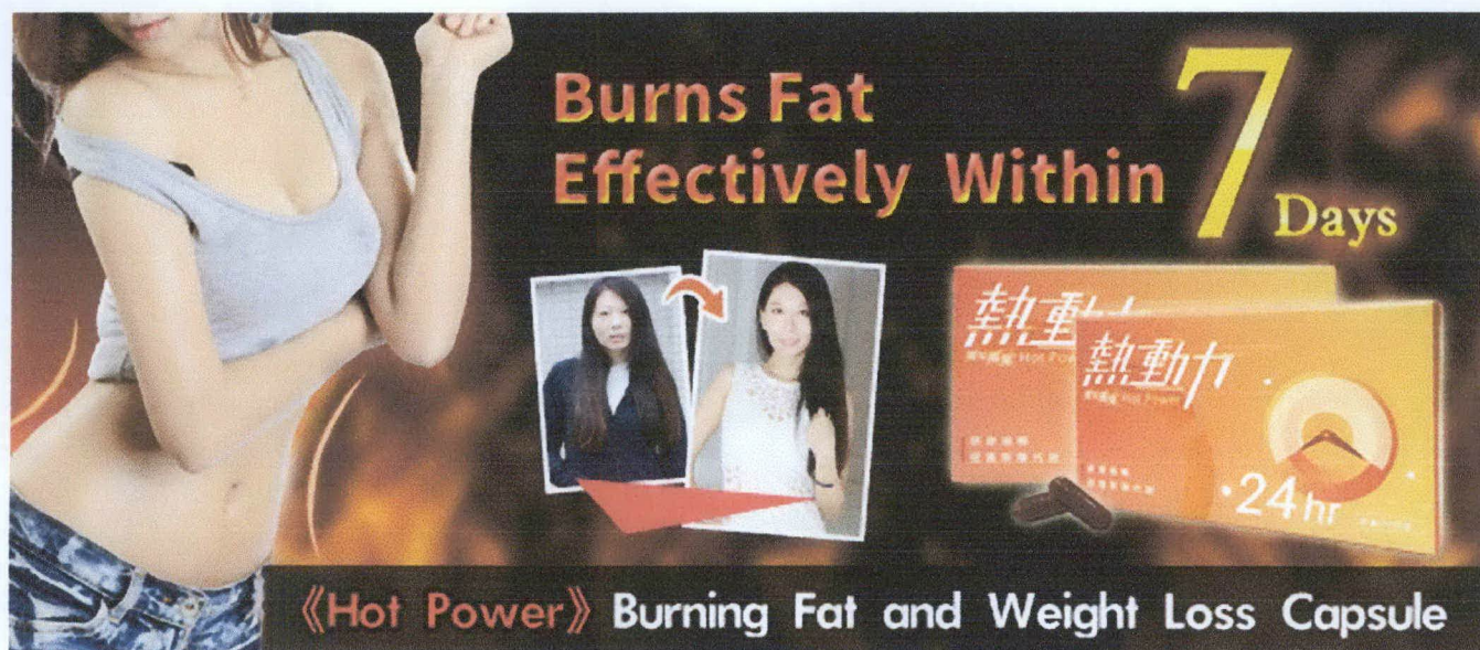
Figure 1. Unregistered Hot Power Burning Fat and Weight Loss Capsule

The Food and Drug Administration (FDA) advises the public against the purchase and consumption of the following unregistered food supplements: