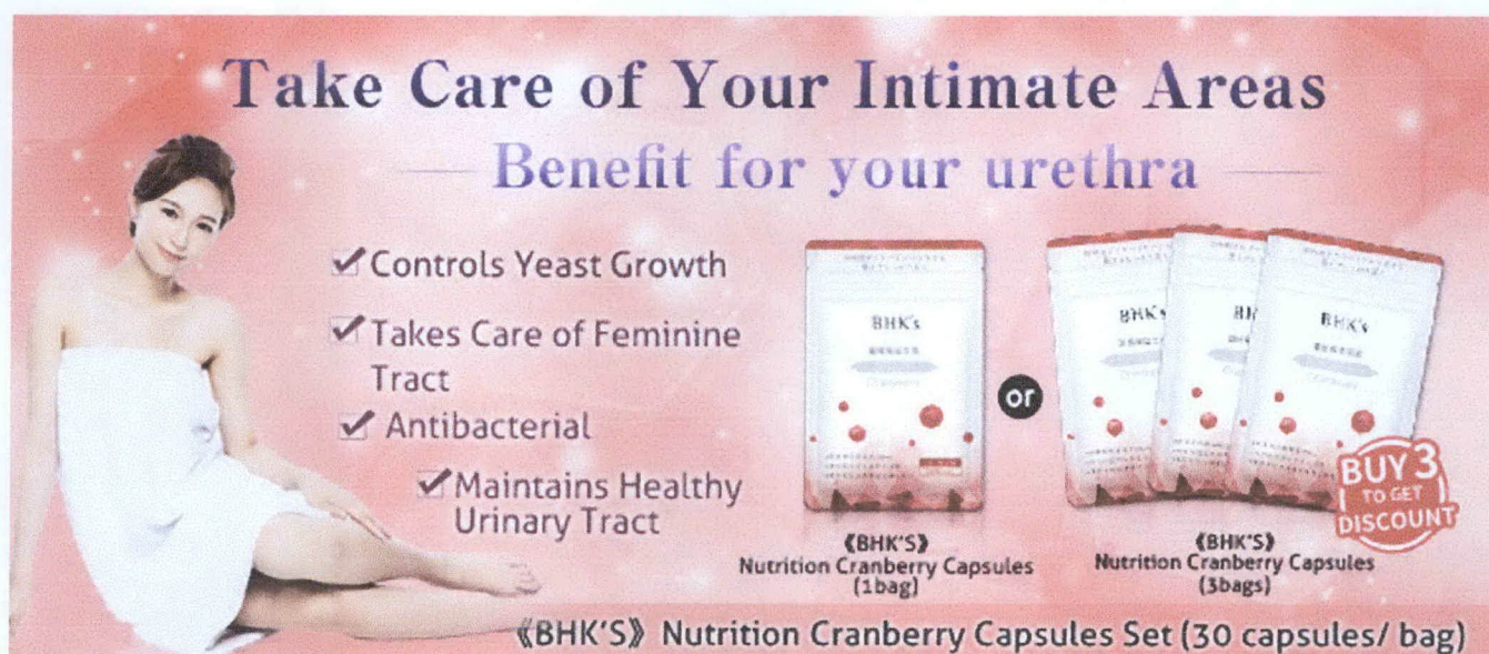
Figure 3. Unregistered BHK's Nutrition Cranberry Capsule Set