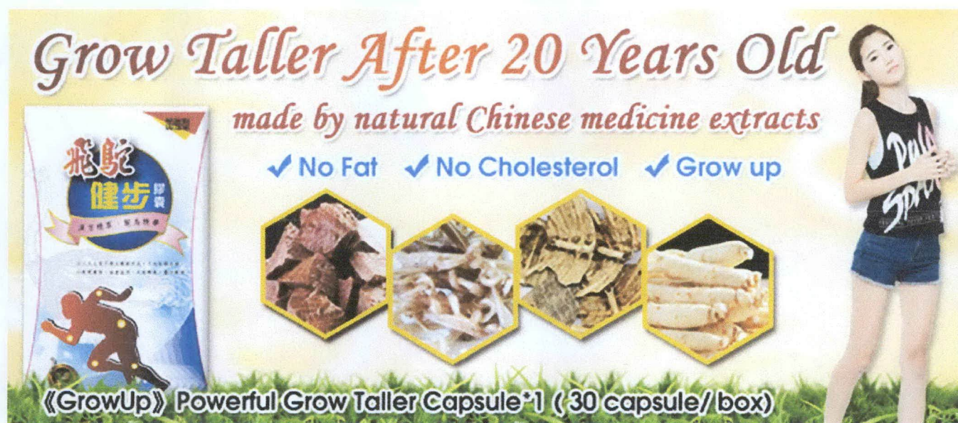
Figure 5. Unregistered Grow up Powerful Grow Taller Capsule

FDA post-marketing surveillance (PMS) activities have verified that the abovementioned food supplements have not gone through the registration process of the agency and have not been issued the proper authorization in the form of Certificate of Product Registration. Pursuant to Republic Act No. 9711, otherwise known as the "Food and Drug Administration Act of 2009", the manufacture, importation, exportation, sale, offering for sale, distribution, transfer, non-consumer use, promotion, advertising or sponsorship of health products without the proper authorization from FDA is prohibited.