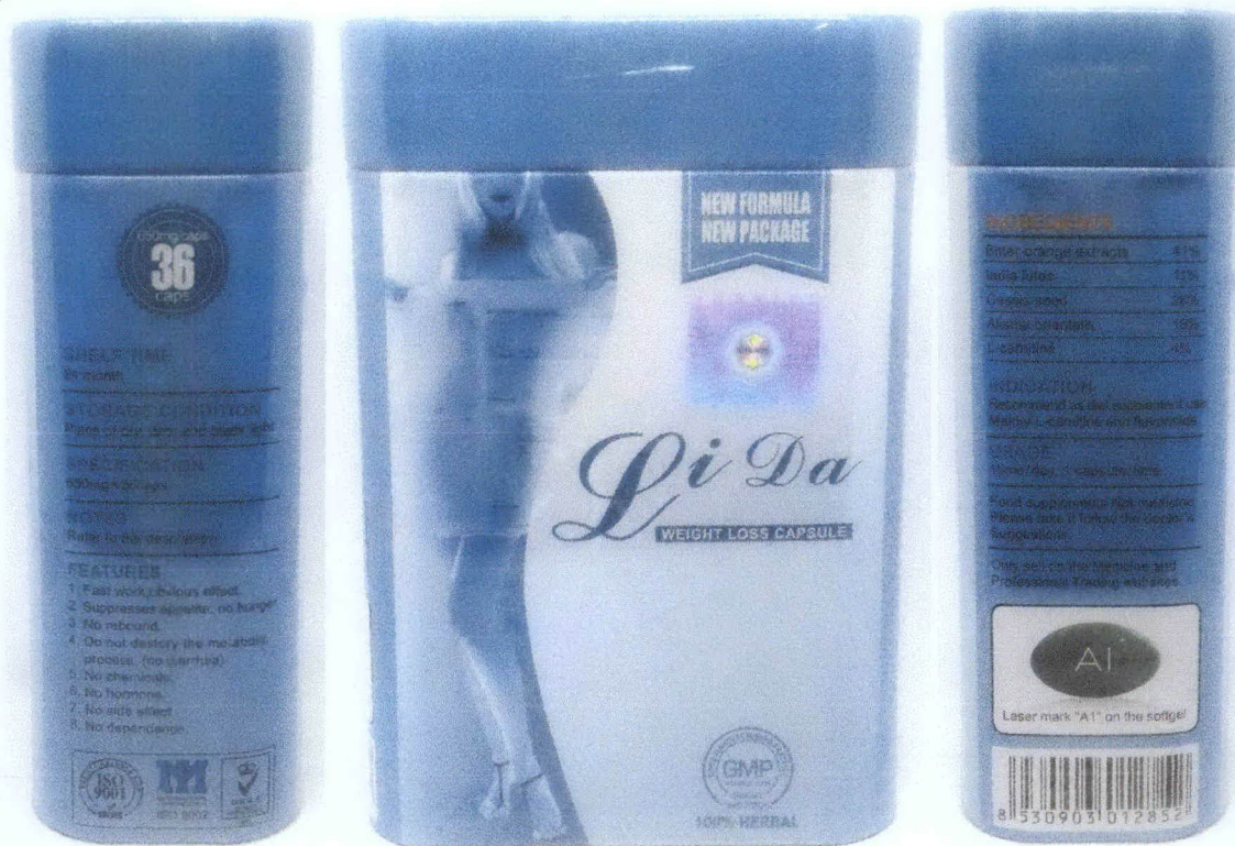
Figure 2. Unregistered LI DA Weight Loss Capsule