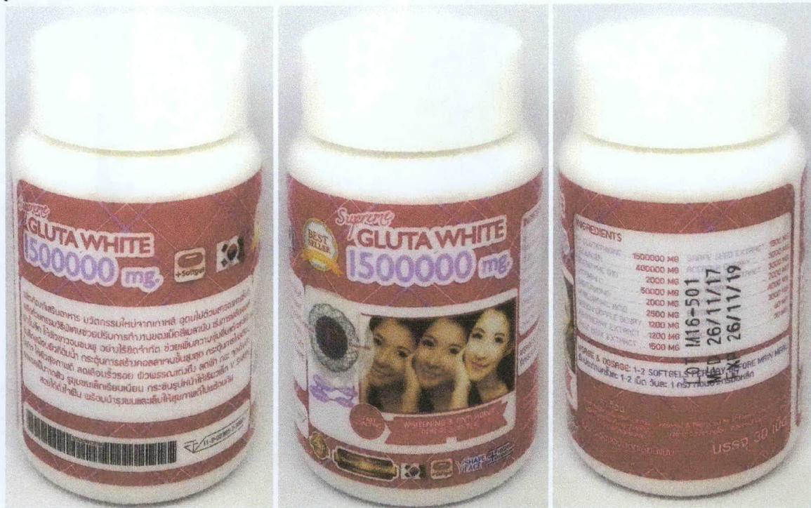
Figure 8. Unregistered SUPREME GLUTA WHITE 1500000 MG Whitening & Anti-Aging

FDA post-marketing surveillance (PMS) activities have verified that the abovementioned food products and food supplements have not gone through the registration process of the agency and have not been issued the proper authorization in the form of Certificate of Product Registration. Pursuant to Republic Act No. 9711, otherwise known as the “Food and Drug Administration Act of 2009”, the manufacture, importation, exportation, sale, offering for sale, distribution, transfer, non-consumer use, promotion, advertising or sponsorship of health products without the proper authorization from FDA is prohibited.