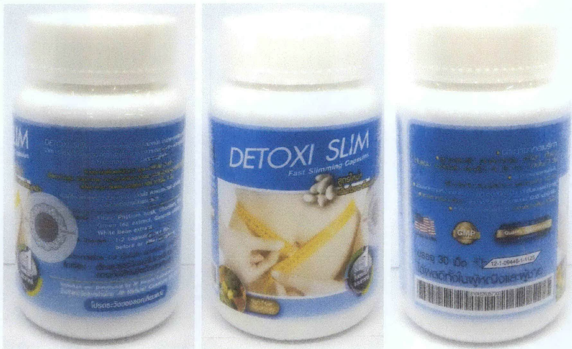
Figure 4. Unregistered DETOXI SLIM Fast Slimming Capsules