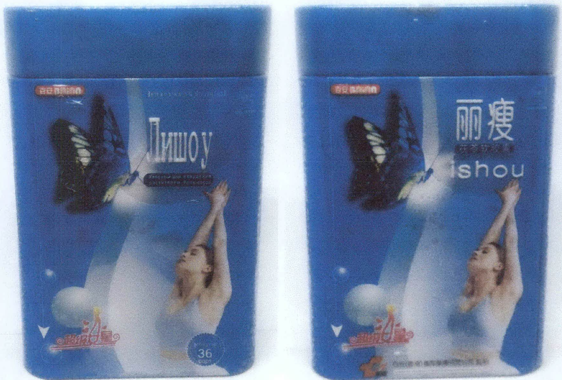
Figure 6. Unregistered FULING RUAN JIAONANG ISHOU