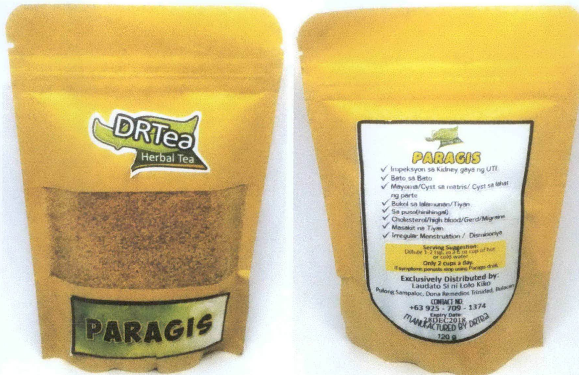
Figure 3. Unregistered DRTEA Herbal Tea Paragis