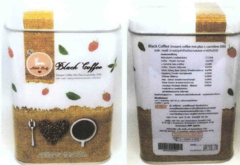
Figure 1. Unregistered LITTLE BABY Black Coffee Instant Coffee Mix Plus L-carnitine 500

The Food and Drug Administration (FDA) advises the public against the purchase and consumption of the following unregistered food products and food supplements: