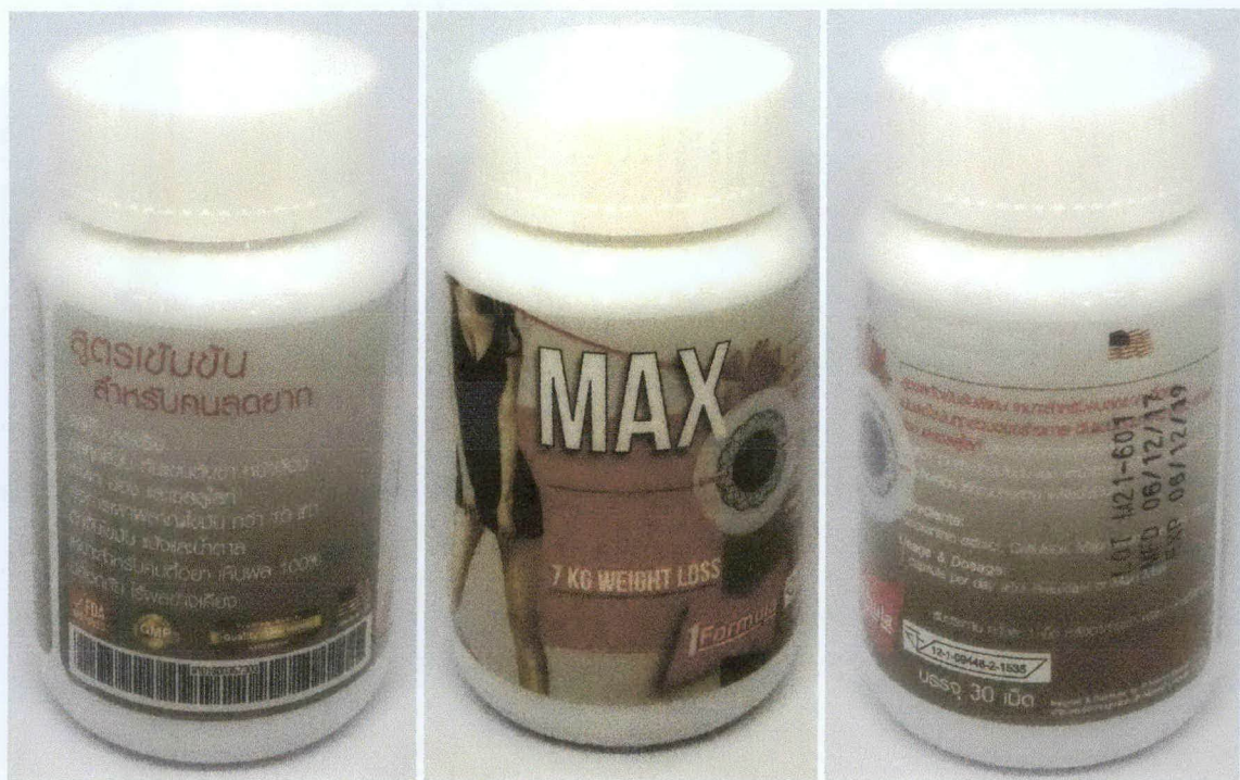
Figure 5. Unregistered MAX SLIM 7 days 7 KG Weight Loss