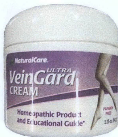
NaturalCare® ULTRA VeinGard® CREAM Homeopathic 64 g Mfd. For: Healthway Corp.