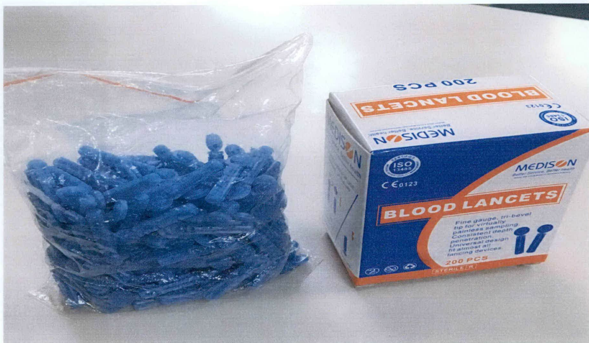
Figure 1. Image of Medison Blood Lancets

The Food and Drug Administration (FDA) advises the general public and all healthcare professionals against the purchase and use of the unregistered medical device products: