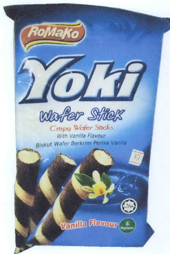
Figure 3. Unregistered ROMAko YOKI Wafer Stick with Vanilla Flavour