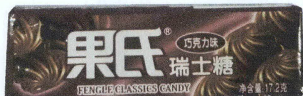
Figure 4. Unregistered FENGLE Classics Candy