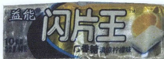
Figure 5. Unregistered YINENG Chewing Gum