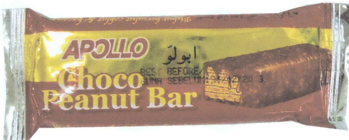
Figure 1. Unregistered APOLLO Choco Peanut Bar

The Food and Drug Administration (FDA) advises the public against the purchase and consumption of the following unregistered food products: