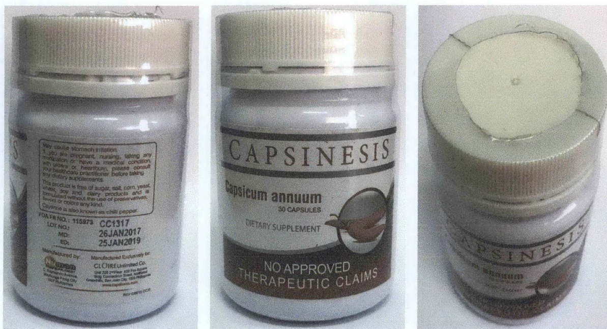
Figure 1. Verified counterfeit CAPSINESIS Capsicum annum Dietary Supplement Capsule

The Food and Drug Administration (FDA) advises the public against the purchase and consumption of the following verified counterfeit food supplement CAPSINESIS Capsicum annum Dietary Supplement Capsule :