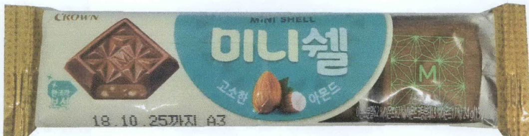
Figure 4. Unregistered CROWN Mini Shell Chocolate, 24g