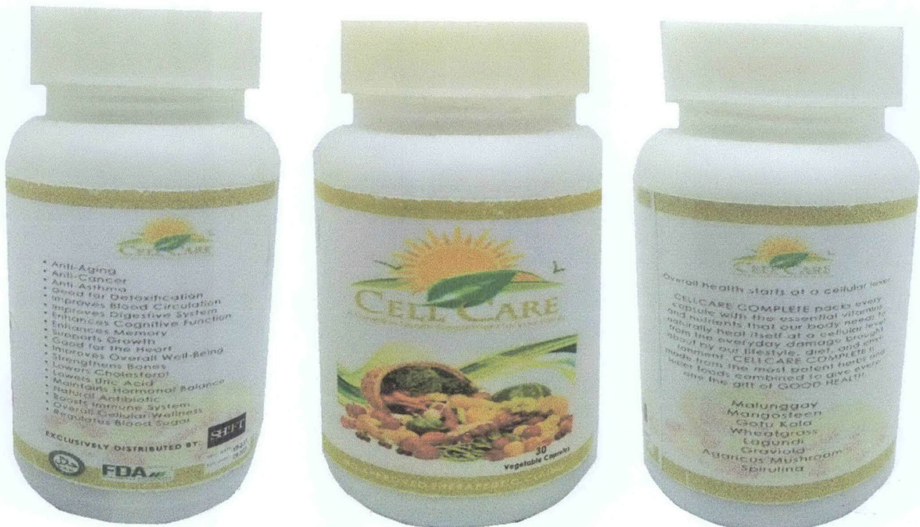
Figure 1. Unregistered CELL CARE Food Supplement

The Food and Drug Administration (FDA) advises the public against the purchase and consumption of the following unregistered food products: