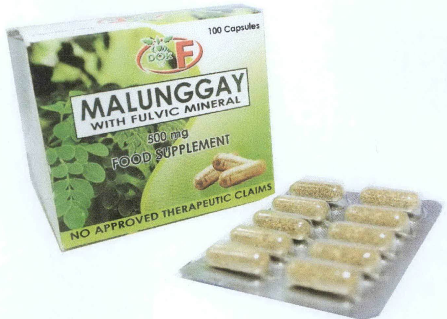
Figure 3. Unregistered Dok F Malunggay with Fulvic Mineral Food Supplement, 500mg