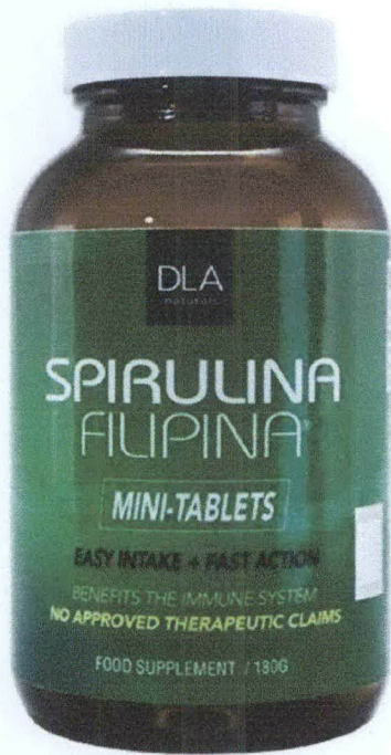
Figure 2. Unregistered DLA NATURALS Spirulina Filipina Mini-Tablets