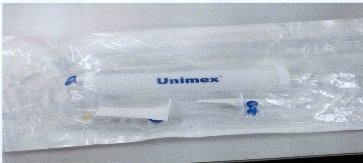
Figure 1. Images of Unimex® Volumetric Infusion Set with Burette 100cc