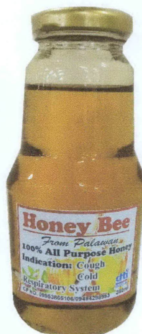
Figure 5. Unregistered HONEY BEE from Palawan 100% All Purpose Honey