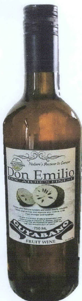
Figure 2. Unregistered DON EMILIO Guyabano Fruit Wine