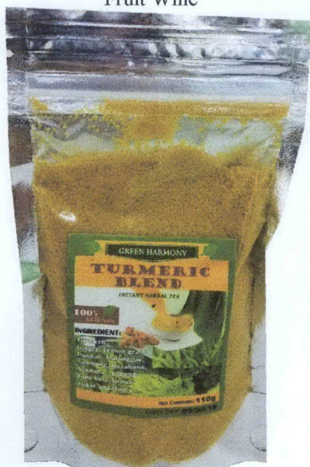
Figure 4. Unregistered GREEN HAROMONY Turmeric Blend Instant Herbal Tea