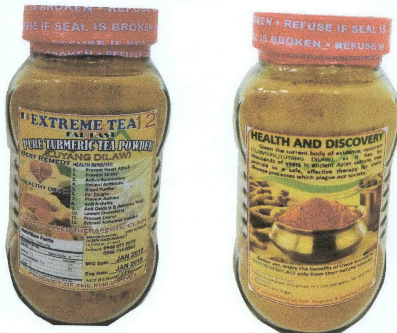
Figure 1. Unregistered EXTREME TEA 12 FAR EAST Pure Turmeric Tea Powder (Luyang Dilaw)

The Food and Drug Administration (FDA) advises the public against the purchase and consumption of the following unregistered food products: