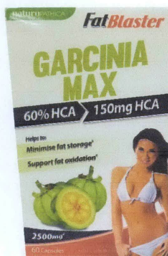
Figure 5. Unregistered NATUROPATHICA Fatblaster Garcinia Max