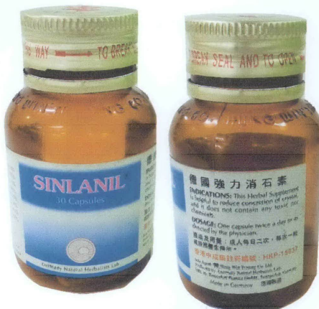
Figure 2. Unregistered SINLANIL Capsules