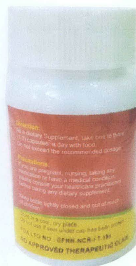
Figure 6. Unregistered TOP C+ Calcium Ascorbate with Rose Hips and Acerola Extract + Moringa