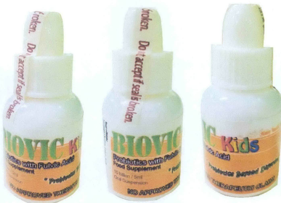
Figure 2. Unregistered BIOVIC KIDS Probiotics with Fulvic Acid Food Supplement