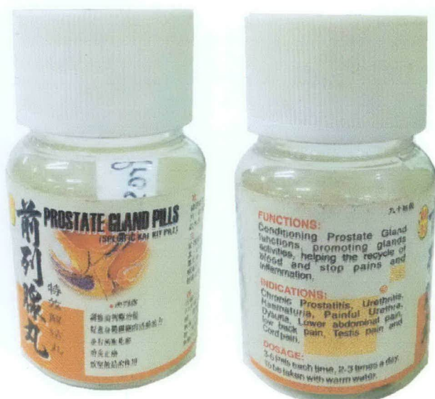
Figure 1. Unregistered PROSTATE GLAND PILLS (Specific Kai Kit Pills)

The Food and Drug Administration (FDA) advises the public against the purchase and consumption of the following unregistered food supplements: