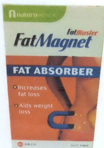
Figure 4. Unregistered NATUROPATHICA Fatblaster FatMagnet Fat Absorber