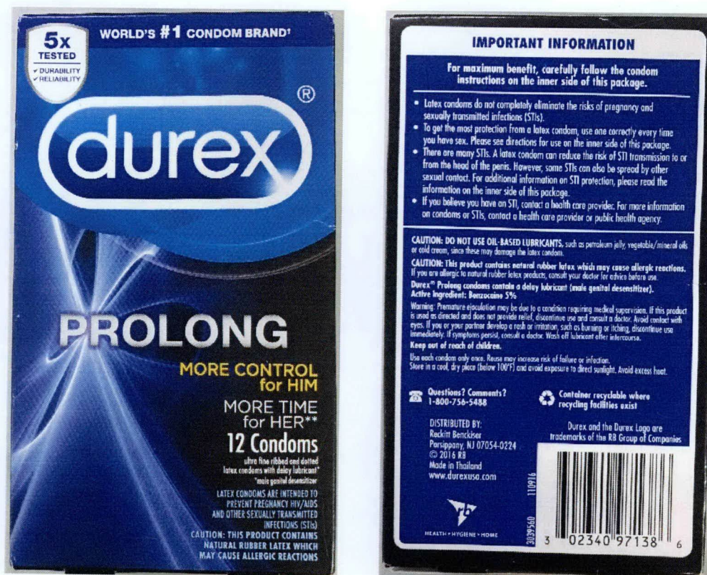
Figure 1. Unregistered Durex Prolong Condom

The Food and Drug Administration (FDA) advises the public against the purchase and use of the following unregistered medical device products: