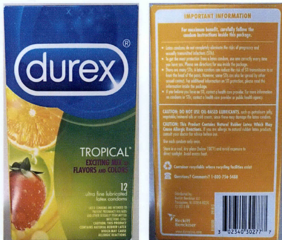
Figure 3. Durex Tropical Exciting Mix of Flavors and Colors Ultra Fine Lubricated Latex Condom

FDA post-marketing surveillance (PMS) activities have verified that the abovementioned medical device products have not gone through the registration process of the agency and have not been issued with proper authorization in the form of Certificate of Product Registration (CPR). Pursuant to Republic Act 9711, otherwise known as the “Food and Drug Administration