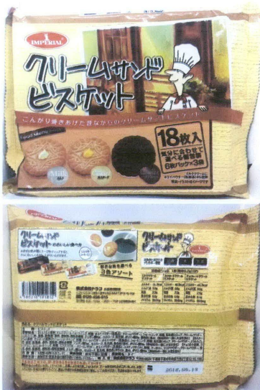
Figure 1. Unregistered IMPERIAL Milk Custard Chocolate Biscuit (in foreign language)

The Food and Drug Administration (FDA) advises the public against the purchase and consumption of the following unregistered food products and food supplement: