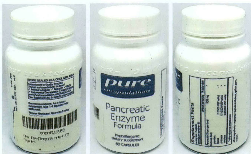
Figure 3. Unregistered PURE ENCAPSULATIONS Pancreatic Enzyme Formula Dietary Supplement 60 Capsules