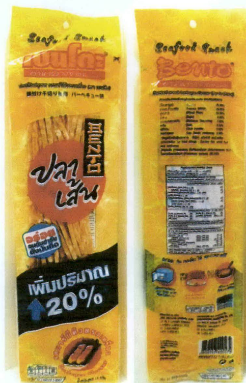
Figure 2. Unregistered Bento Seafood Snack Barbeque Flavor