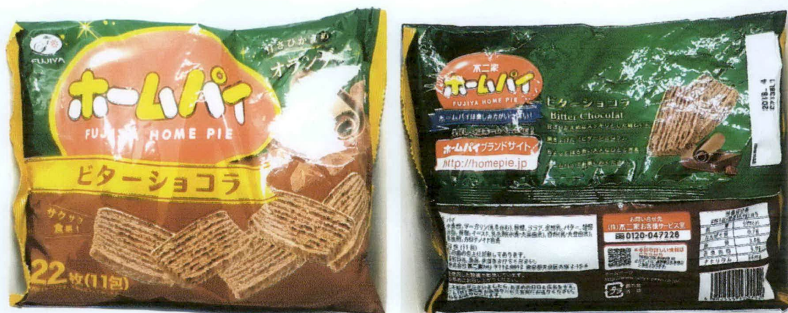
Figure 4. Unregistered Fujiya Home Pie Bitter Chocolat