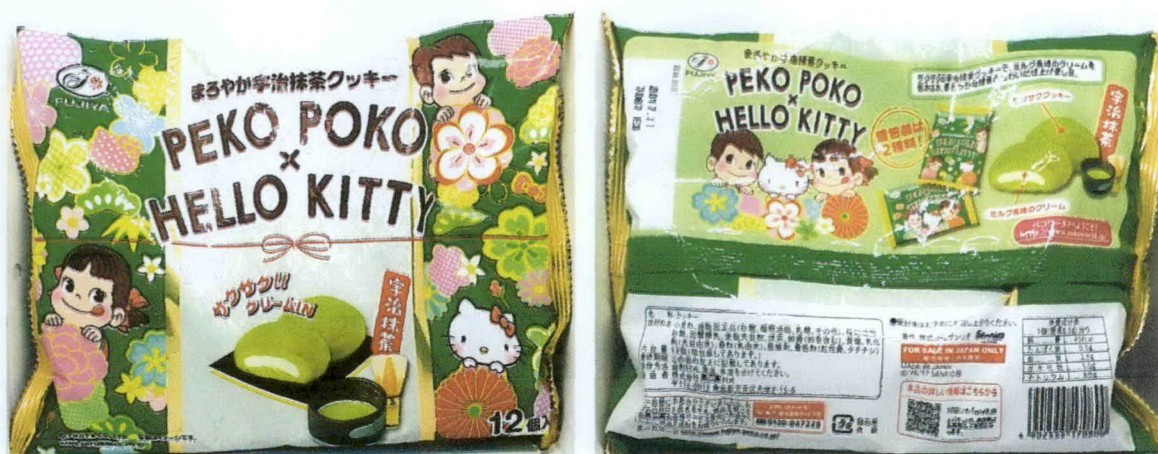
Figure 5. Unregistered Fujiya Peko Peko x Hello Kitty

FDA post-marketing surveillance (PMS) activities have verified that the abovementioned food products and food supplement have not gone through the registration process of the agency and have not been issued the proper authorization in the form of Certificate of Product Registration. Pursuant to Republic Act No. 9711, otherwise known as the “Food and Drug Administration Act of 2009”, the manufacture, importation, exportation, sale, offering for sale, distribution, transfer, non-consumer use, promotion, advertising or sponsorship of health products without the proper authorization from FDA is prohibited.