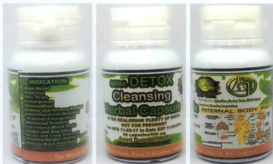
Figure 3. Unregistered ULTRA DETOX CLEANSING Herbal Capsule