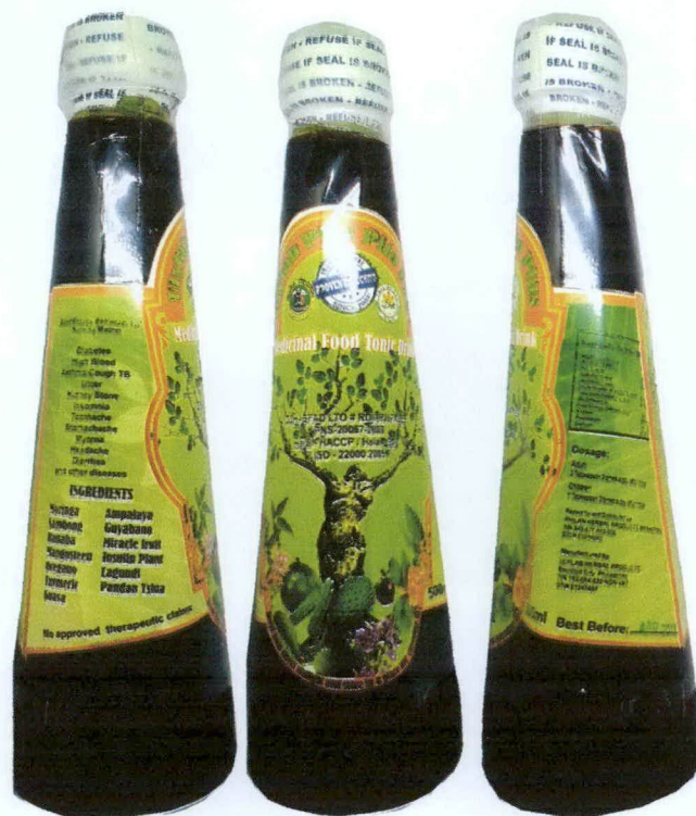
Figure 4. Unregistered Uylab Pito Pito Plus Medicinal Food Tonic Drink