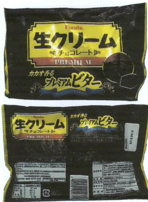
Figure 1. Unregistered Furuta Premium

The Food and Drug Administration (FDA) advises the public against the purchase and consumption of the following unregistered food product and food supplements: