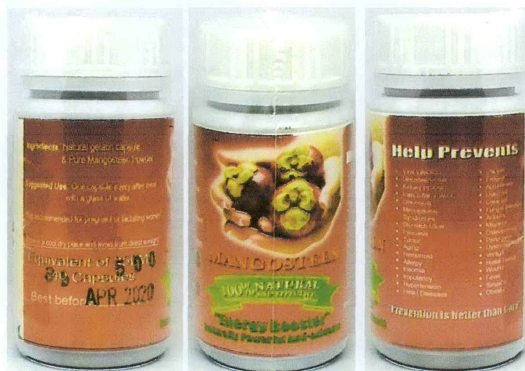
Figure 5. Unregistered Mangosteen "Energy Booster" Naturally Powerful Anti-Oxidant

FDA post-marketing surveillance (PMS) activities have verified that the abovementioned food product and food supplements have not gone through the registration process of the agency and have not been issued the proper authorization in the form of Certificate of Product Registration. Pursuant to Republic Act No. 9711, otherwise known as the "Food and Drug Administration Act of 2009", the manufacture, importation, exportation, sale, offering for sale,