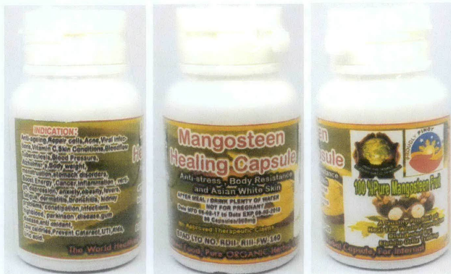
Figure 2. Unregistered Mangosteen Healing Capsule