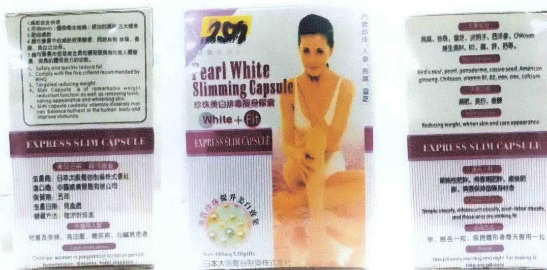
Figure 5. Unregistered EXTRA FROM JAPAN Pearl White Slimming Capsule WHITE+FIT EXPRESS SLIM CAPSULE

FDA post-marketing surveillance (PMS) activities have verified that the abovementioned food products and food supplements have not gone through the registration process of the agency and have not been issued the proper authorization in the form of Certificate of Product Registration. Pursuant to Republic Act No. 9711, otherwise known as the “Food and Drug Administration Act of 2009”, the manufacture, importation, exportation, sale, offering for sale, distribution, transfer, non-consumer use, promotion, advertising or sponsorship of health products without the proper authorization from FDA are prohibited.