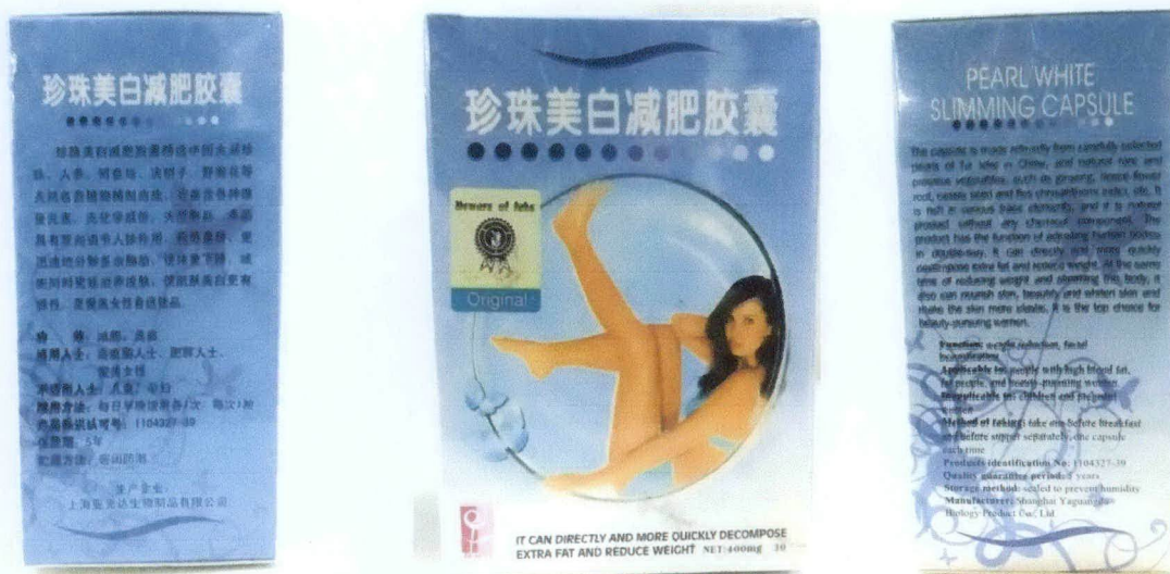
Figure 4. Unregistered ENDLESS BEAUTY Pearl White Slimming Capsule