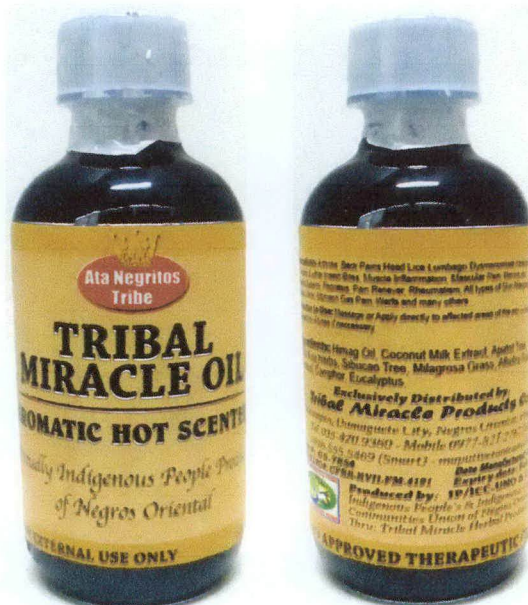
Figure 2. Unregistered ATA NEGROS TRIBE Tribal Miracle Oil Aromatic Hot Scented