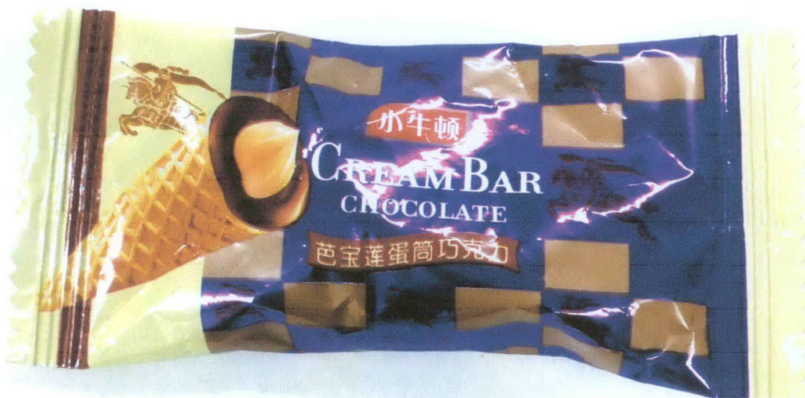
Figure 1. Unregistered Cream Bar Chocolate (With Foreign Markings)

The Food and Drug Administration (FDA) advises the public against the purchase and consumption of the following unregistered food product and food supplements: