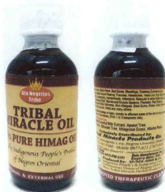
Figure 3. Unregistered ATA NEGROS TRIBE Tribal Miracle Oil 100% Pure Himag Oil