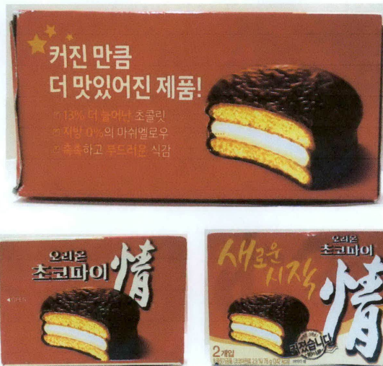
Figure 4 Unregistered (In Foreign Language) Chocolate Coated Cookies