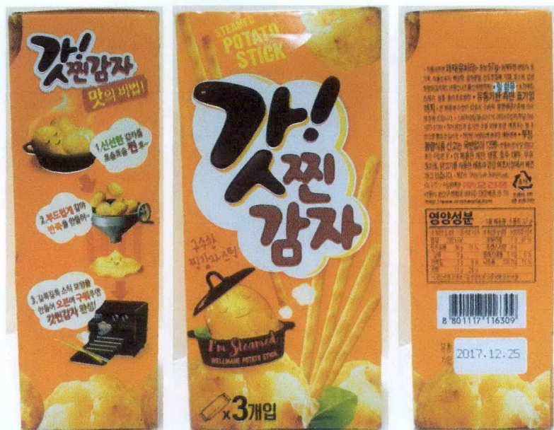
Figure 2. Unregistered (In Foreign Language) Steamed Potato Stick