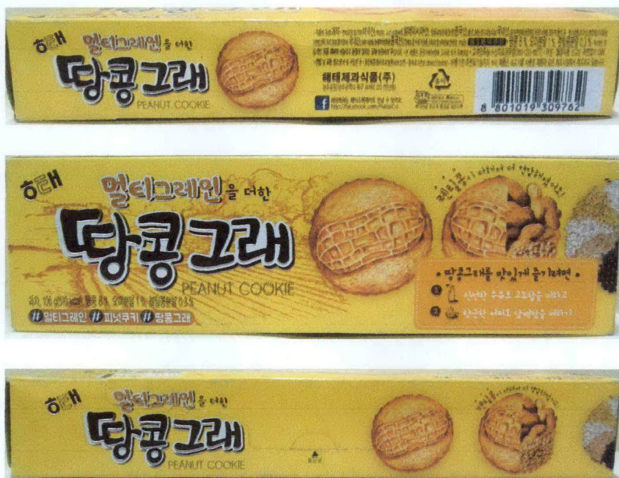
Figure 3. Unregistered (In Foreign Language) Peanut Cookies