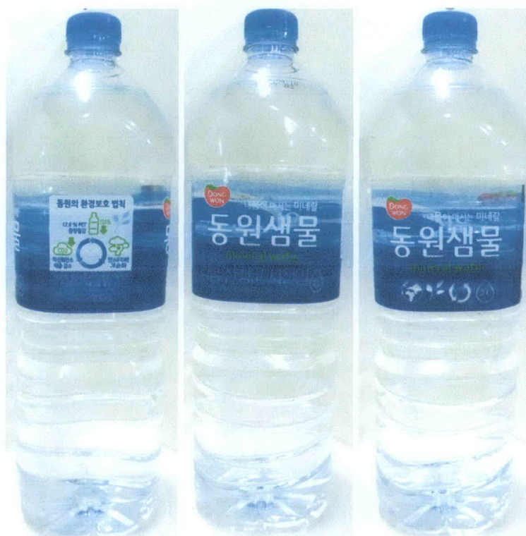
Figure 1. Unregistered Dong Won Mineral Water

The Food and Drug Administration (FDA) advises the public against the purchase and consumption of the following unregistered food products: