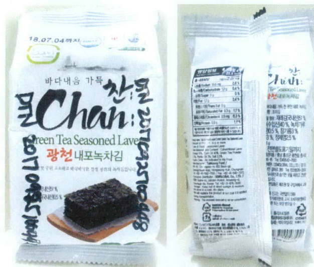
Figure 5 Unregistered Chan Green Tea Seasoned Laver

FDA post-marketing surveillance (PMS) activities have verified that the abovementioned food products have not gone through the registration process of the agency and have not been issued the proper authorization in the form of Certificate of Product Registration. Pursuant to Republic Act No. 9711, otherwise known as the “Food and Drug Administration Act of 2009”, the manufacture, importation, exportation, sale, offering for sale, distribution, transfer, non-