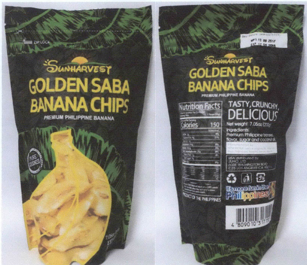
Figure 1. Registered SUN HARVEST GOLDEN Saba Banana Chips (Premium Philippine Banana)

This is to inform the public that the advisory regarding the product "SUN HARVEST GOLDEN Saba Banana Chips (Premium Philippine Banana)" under FDA Advisory No. 2017-089 dated 16 March 2017 is lifted.