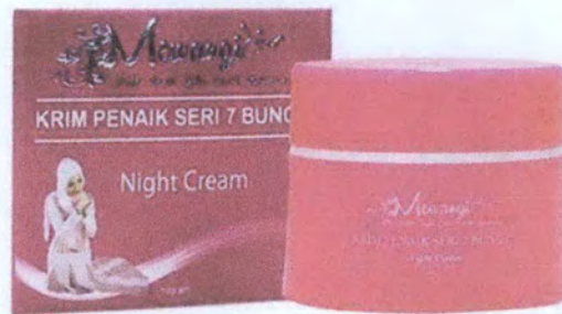
Mewangi Putih • Anjal • Gebu • Cantik • Menawan Krim Penaik Seri 7 Bunga – Night Cream