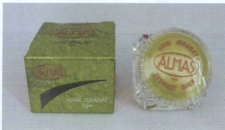
ALMAS Cantik • Cerah • Gebu Krim Jeragat