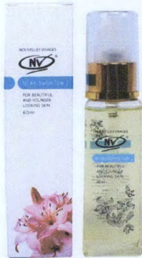
Nouvelles Visages NV Anti Blemish Toner 2 For Beautiful and Younger Looking Skin