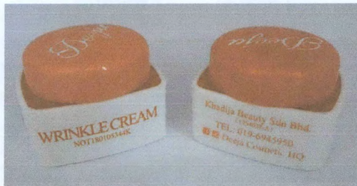
Deeja Keayuan Semula Jadi Wrinkle Cream