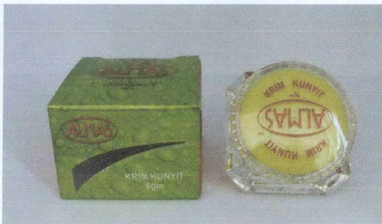
ALMAS Cantik • Cerah • Gebu Krim Kunyit