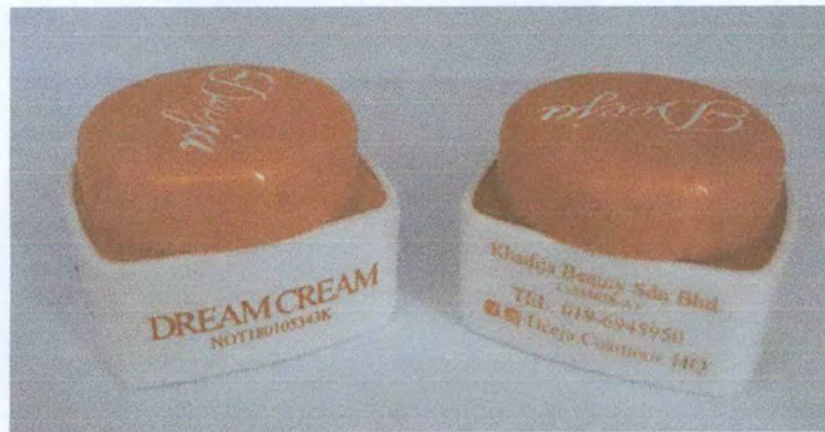
Deeja Keayuan Semula Jadi Dream Cream