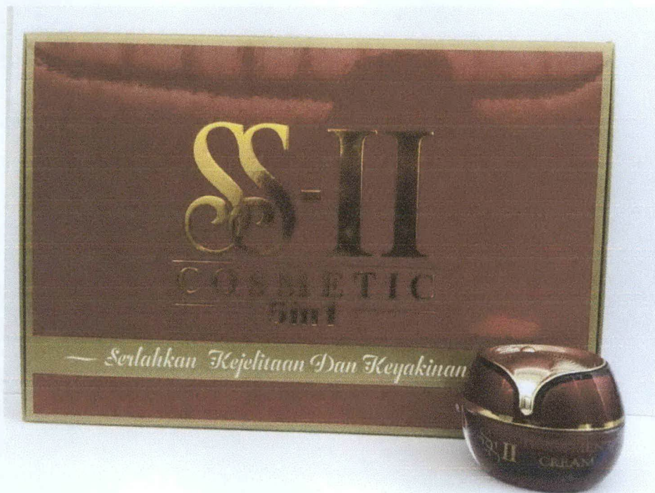
SS-II Cosmetic 5 in 1 Serlahkan Kejelitaanmu – Herbal Cream