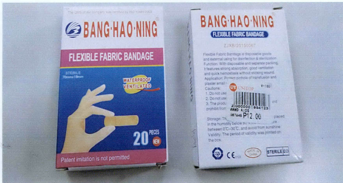
Figure 1. Bang-Hao-Ning Flexible Fabric Bandage

The Food and Drug Administration (FDA) advises the general public and all healthcare professionals against the purchase and use of the unregistered medical device: