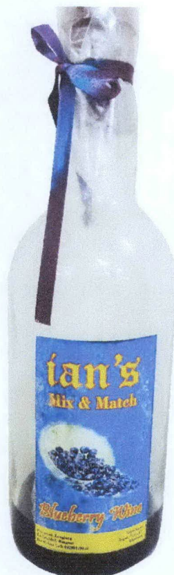
Figure 4. Unregistered IAN'S MIX & MATCH Bluberry Wine