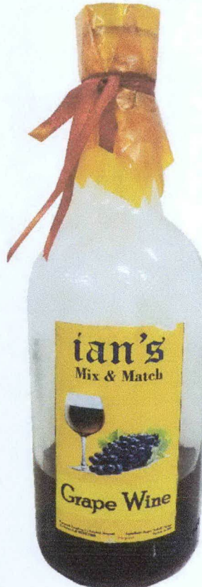
Figure 6. Unregistered IAN'S MIX & MATCH Grape Wine