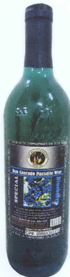
Figure 2. Unregistered DON CONRADO PARADISE WINE, Special Blueberry