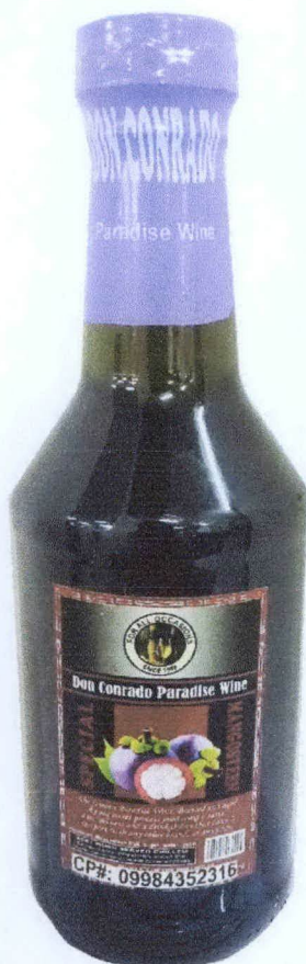
Figure 3. Unregistered DON CONRADO PARADISE WINE, Special Mangosteen