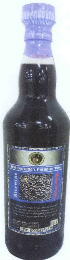
Figure 1. Unregistered DON CONRADO PARADISE WINE, Rice Wine

The Food and Drug Administration (FDA) advises the public against the purchase and consumption of the following unregistered food products: