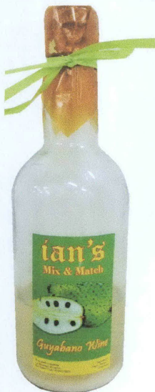
Figure 5. Unregistered IAN'S MIX & MATCH Guyabano Wine