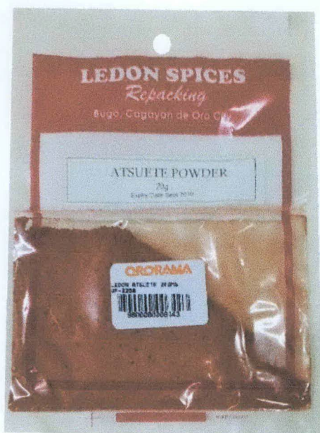
Figure 1. Unregistered LEDON SPICES REPACKING Atsuete Powder, 20g

The Food and Drug Administration (FDA) advises the public against the purchase and consumption of the following unregistered food products: