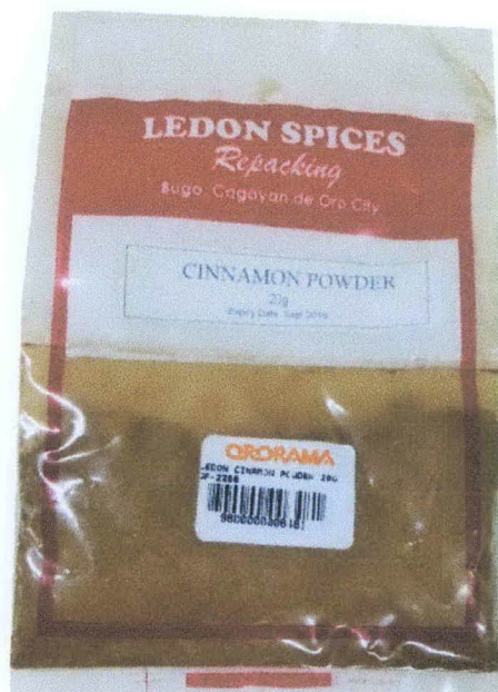
Figure 2. Unregistered LEDON SPICES REPACKING Cinnamon Powder, 20g