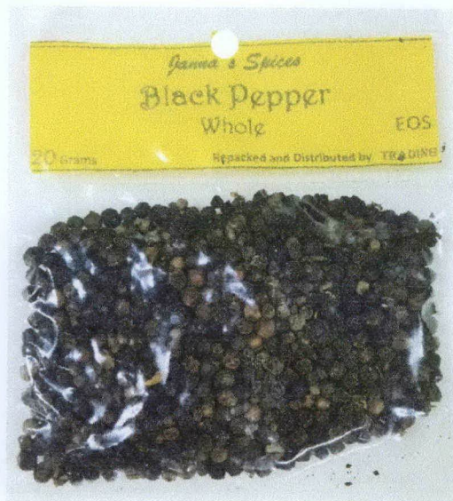
Figure 3. Unregistered JANNA'S SPICES Black Pepper, Whole, 20g