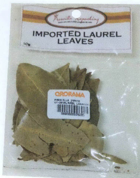
Figure 5. Unregistered PRESCILLA REPACKING Imported Laurel Leaves