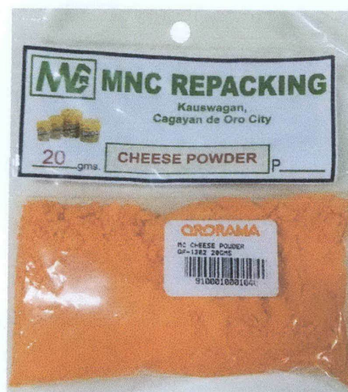
Figure 6. Unregistered MNC Repacking Cheese Powder, 20g