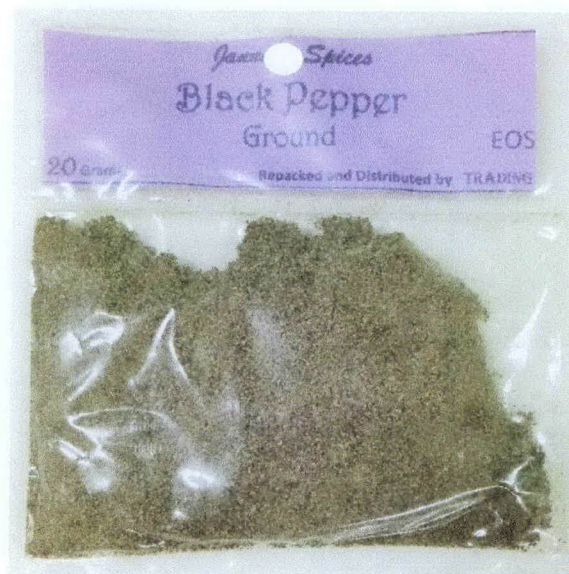
Figure 4. Unregistered JANNA'S SPICES Black Pepper, Ground, 20g