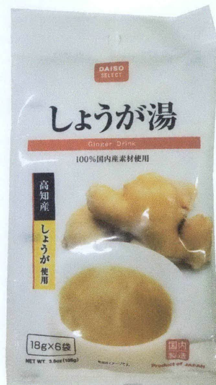
Figure 4. Unregistered DAISO SELECT Ginger Drink