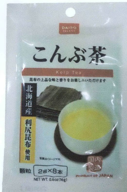
Figure 2. Unregistered DAISO SELECT Kelp Tea