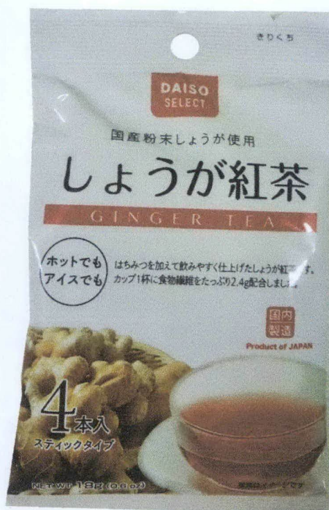
Figure 3. Unregistered DAISO SELECT Ginger Tea