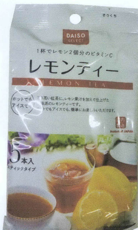
Figure 4. Unregistered DAISO SELECT Lemon Tea