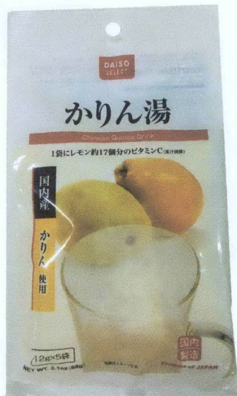
Figure 1. Unregistered DAISO SELECT Chinese Quince Drink

The Food and Drug Administration (FDA) advises the public against the purchase and consumption of the following unregistered food products: