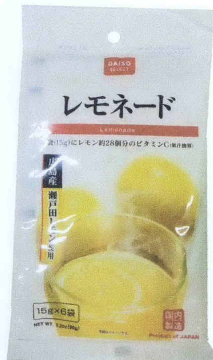
Figure 5. Unregistered DAISO SELECT Lemonade