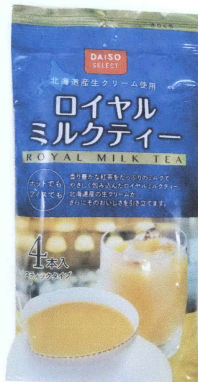
Figure 2. Unregistered DAISO SELECT Royal Milk Tea