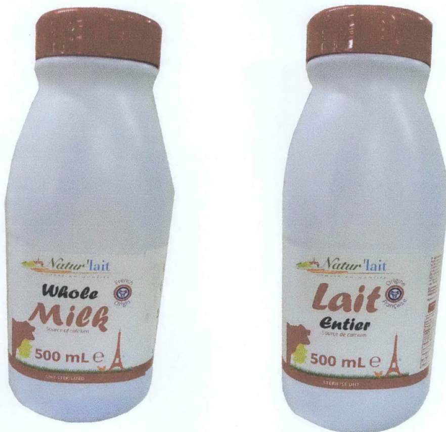
Figure 3. Unregistered NATUR' LAIT Whole Milk