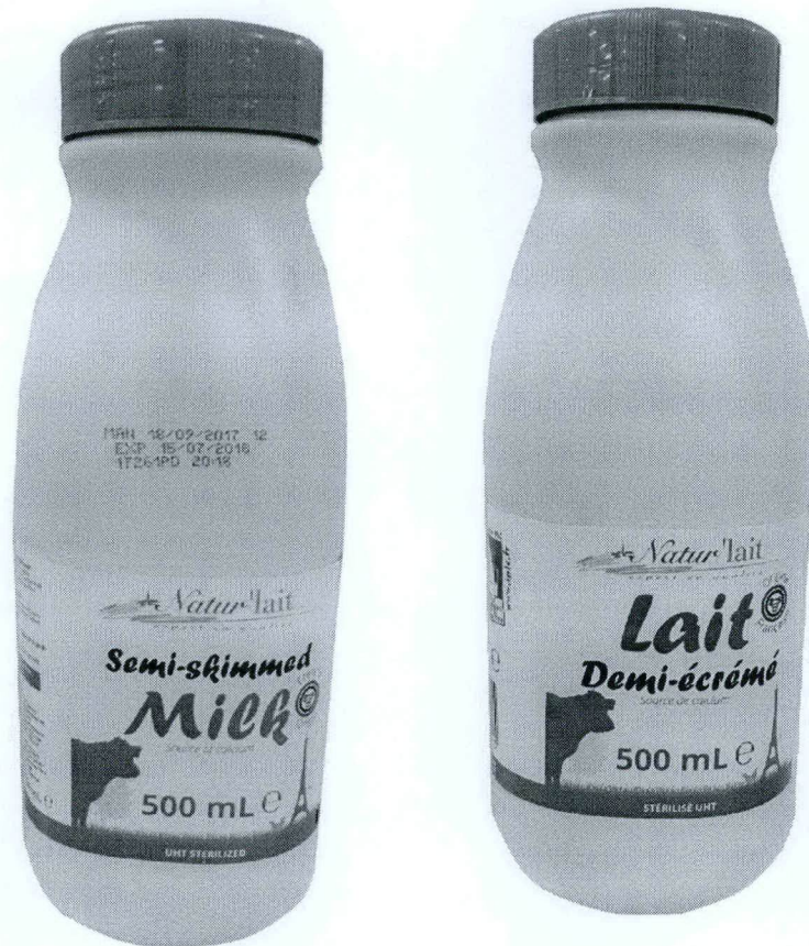
Figure 5. Unregistered NATUR' LAIT Semi-Skimmed Milk

FDA post-marketing surveillance (PMS) activities have verified that the abovementioned food products have not gone through the registration process of the agency and have not been issued the proper authorization in the form of Certificate of Product Registration. Pursuant to Republic Act No. 9711, otherwise known as the "Food and Drug Administration Act of 2009", the manufacture, importation, exportation, sale, offering for sale, distribution, transfer, non-consumer use, promotion, advertising or sponsorship of health products without the proper authorization from FDA is prohibited.