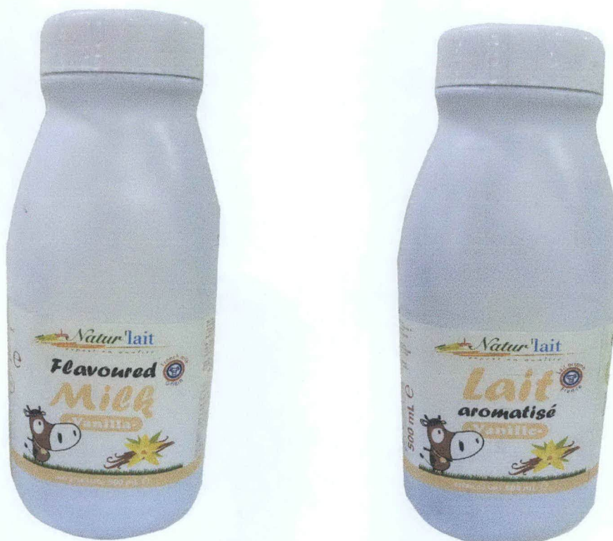
Figure 4. Unregistered NATUR' LAIT Flavoured Milk, Vanilla