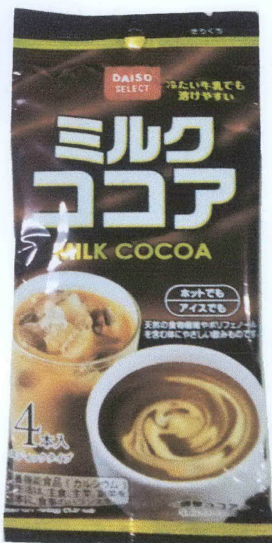
Figure 1. Unregistered DAISO SELECT Milk Cocoa

The Food and Drug Administration (FDA) advises the public against the purchase and consumption of the following unregistered food products: