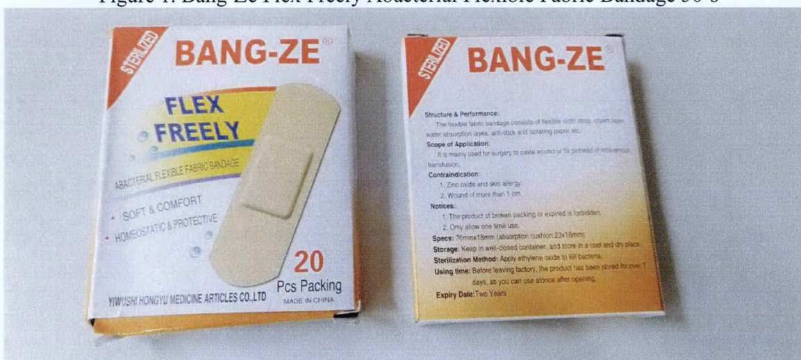
Figure 2. Bang-Ze Flex Freely Abacterial Flexible Fabric Bandage 20's