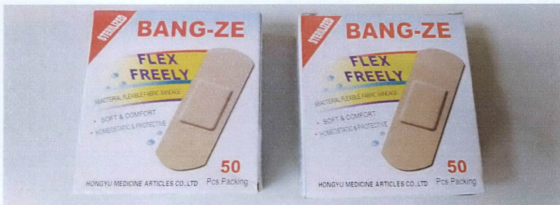
Figure 1. Bang-Ze Flex Freely Abacterial Flexible Fabric Bandage 50's

The Food and Drug Administration (FDA) advises the general public and all healthcare professionals against the purchase and use of the unregistered medical devices: