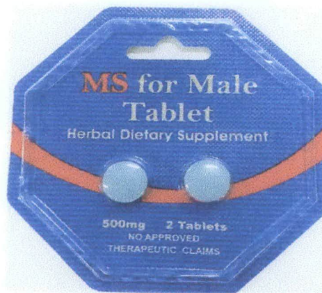
Figure 1. MS FOR MALE TABLET Herbal Dietary Supplement

The public is hereby informed that the Food and Drug Administration (FDA) has conducted sampling of specific batches of the following herbal dietary/food supplements for men as part of the strengthened post-marketing surveillance of this Office: