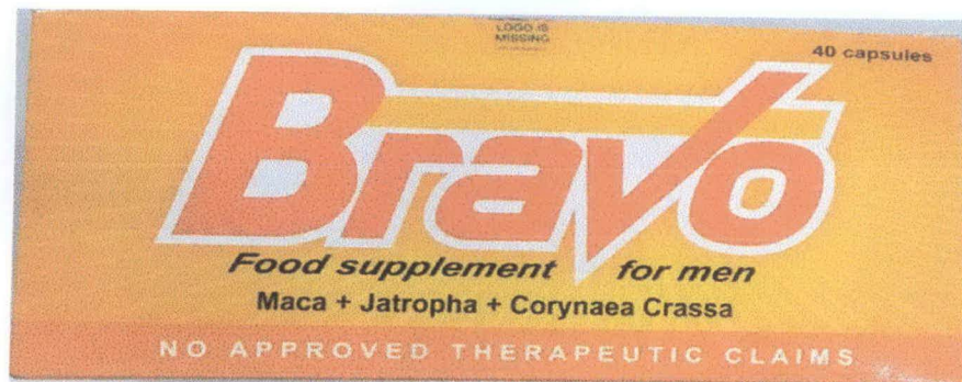
Figure 2. BRAVO Maca + Jatropha + Corynaea Crassa Food Supplement for Men